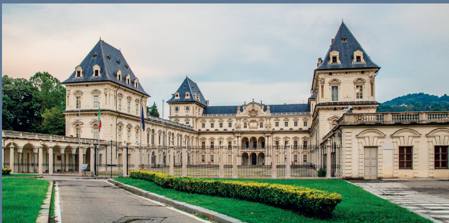
The Castle of Valentino, home to the architecture faculty at Polytechnic University of Turin

Despite many initiatives to support and implement OA practices, there is still a lot of