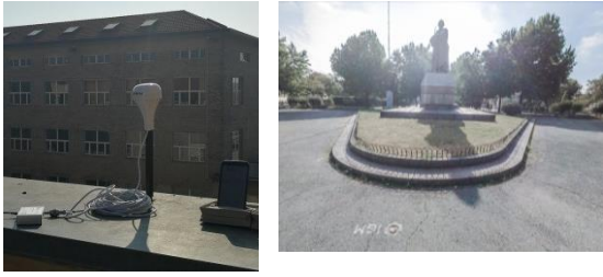
Figure 1: The two test sites: the place that represent the noisy environment (left, site A) and an undisturbed place (right, site C).

The second one is an undisturbed site, characterized by the absence of reflective surfaces, electromagnetic disturbances and with optimal conditions for tracking satellites (e.g. no obstructions). These two sites, namely A and C (Figure 1), respectively, represent the two main conditions where a user works or tries to perform positioning activities.