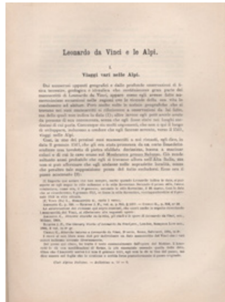
Figure 1: Leonardo da Vinci e le Alpi [1].

In the extended field explored by the history of civil engineering, linked with the wide and articulated discipline of the history of architecture, the research about the education of the engineer is included in the discussion, in the nineteenth century even today, concerned the relationship between different matters and distinct teaching methods. The discussion is often focused on the value of lectures, evaluated like theoretical lessons, related with practise exercises, with the ultimate goal of educating graduate technicians with a lot of professional skills. Sometimes, in the teaching programme or in the rare handwritten notes