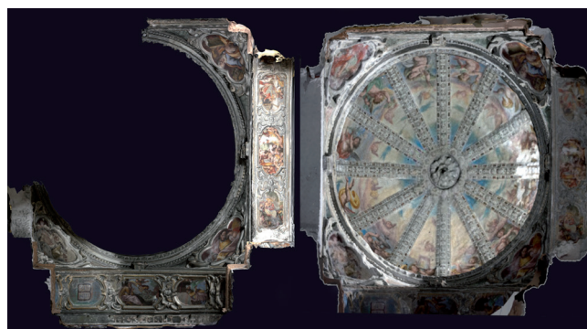
Figure 1.- Orthophotograph made from the three-dimensional model of the dome of the Purification Chapel of the church of Santa Maria del Carmine in Milan, Italy.

We have a case where the three-dimensional restitution is made in draft form using the technique of convergent photogrammetry (restitution of geometry by performing conventional photographs that are interpreted by a computer programme which also generates a three-dimensional model texture—mapping—applied to it) García León (2008). The preference for using this technique rather than others, such as a laser scanner, is because we are obtaining a map of faithful colours applied to a three-dimensional model which is essential for our purposes and the cameras of the scanner do not allow us to obtain a final quality result. Conventional digital photography applied in this system allows us to perform white balance, and all necessary corrections before making photographs, thus giving us a high quality texture.