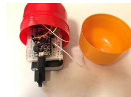
Fig. 5. Configuration of one of the used transmitters for star-topology network measurements. The prototypal transmitter is powered with a power bank connected to the electronic board through a USB cable. The antenna is inside the plastic enclosure.

In order to check how LoRa works in a star topology net, static measurements were performed with a star configuration. Aim of this test was to check how a LoRa based star topology network works. This configuration could be the most suitable for an ad-hoc deployed network, regardless its purpose.