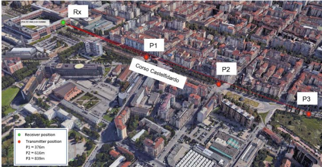
Fig. 3. Positions of the transmitter (P1, P2 and P3) and of the receiver (Rx), with relative distances for the point-to-point measurements.

A set of static measurements was performed with the receiver placed in a fixed position and the receivers along Corso Castelfidardo in different positions (P1, P2, and P3) as shown in Fig. 3.