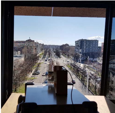
Fig. 4. View of Corso Castelfidardo from the receiver position.

The distance between the transmitter and the receiver was 375 m for P1, 615 m for P2 and 840 m for P3. The receiver was placed at a height of 20 m above the street and the transmitter at a height of 3 m. For all the positions, the transmitter was in line of sight with the receiver.