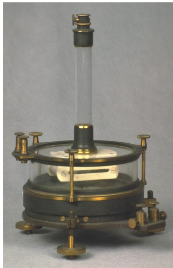
Fig. 7. Nobili galvanometer