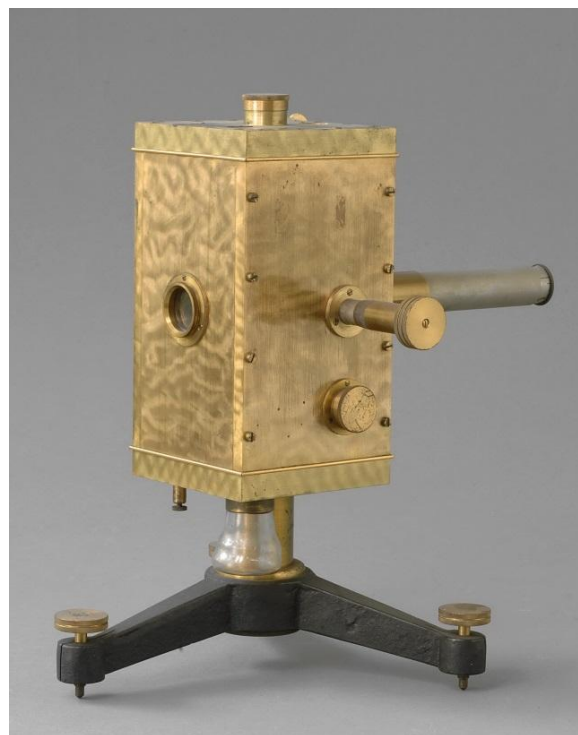
Fig. 3. New Leiss electrometer (Modello Perucca 1926) thin wire (inventory n. 50)

The collection of electrical measuring instruments and equipment includes electrometers, galvanometers, ammeters, voltmeters, used for teaching and research from 1920 to 1960. The Perucca's wire tapping electrometer (1927), the static galvanometer for direct current of Nobili and the Ayrton-Mather. There are also three sets of scientific instruments for didactic purposes, one for induced currents experiences, one for experiences under vacuum, one for experiences with rarefied gas, kept at the Physics Department. The first collection includes educational tools, including Rühmkorff's spool, Righi's oscillator, Tesla's transformer, Pacinotti's ring, and Palmieri's circle. Pioneering equipment in the vacuum field forms the second collection. Some molecular pumps such as Gaede (1930) and other equipment, built between 1920 and 1930, were used for electrology experiments by Eligio Perucca. The third collection includes instruments for the study of discharges into rarefied gases, including Geissler tube, Röntgen tubes with regulator, Lecher tube, incandescent lamps (Edison effect) and Crookes radiometer.