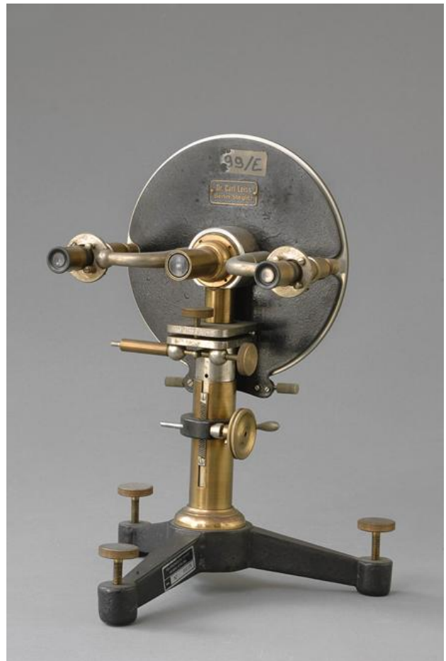
Fig. 6. Two Field Lippich Twilight Analyzer. A device used for the determination of straight-line polarized light when it crosses a certain thickness of optically active substances.