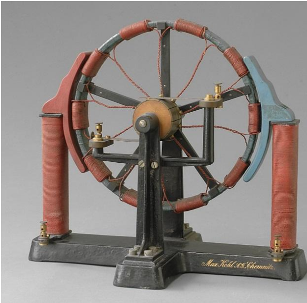
Fig. 4. Pacinotti machine model (Pacinotti ring): device with which, superimposing a large number of pulsed f.e.m. that are suitably offset, a constant voltage is obtained.

Regarding the Chemistry collections, they contain instrumentations for chemical analysis and testing equipment from 1920 to 1940. Among the measurement instruments two collections of equipment, one for electrical measurements and the other one for physical measurements may be found, including instruments used for polarized light studies of 1960.