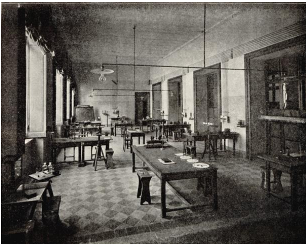
Fig. 2. The Laboratory of Fisica Sperimentale of the Museo Industriale.

Regio Museo Industriale were moved to Castello del Valentino, located in the central building of the castle and opened to public, as well as those of the Scuola di applicazione per gli ingegneri located in a wing of the castle. The Politecnico owned and managed the Museo di Geologia e Mineralogia and the Museo Industriale. In addition to these museums, there were also rich collections of didactic artefacts, such as the collection of materials of the Gabinetto di Architettura Antica e Tecnica degli Stili, or the Curioni Collection of Modelli di costruzioni or the collections of the Modelli di Meccanica or of the Strumenti di Topografia. After some movements of the collections from the Castello del Valentino to via dell'Ospedale, in the night of 8 th December 1942, during a bombing of allied forces, the Museo Industriale was laid to the ground and only a few pieces of the collections survived, in particular those belonging to the Museo di Geologia e Mineralogia relocated to the Museo Industriale in 1936, occupying the spaces left free from the Scuola di Elettrotecnica moved to new headquarters. After the bombing, the surviving material was moved to the Castello del Valentino, waiting for the definitive transfer in 1958 in the new building of Politecnico in Corso Duca degli Abruzzi.