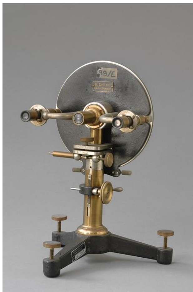
Fig. 6. Two Field Lippich Twilight Analyzer. A device used for the determination of straight-line polarized light when it crosses a certain thickness of optically active substances.