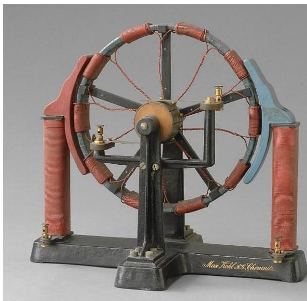
Fig. 4. Pacinotti machine model (Pacinotti ring): device with which, superimposing a large number of pulsed f.e.m. that are suitably offset, a constant voltage is obtained.

Regarding the Chemistry collections, they contain instrumentations for chemical analysis and testing equipment from 1920 to 1940. Among the measurement instruments two collections of equipment, one for electrical measurements and the other one for physical measurements may be found, including instruments used for polarized light studies of 1960.