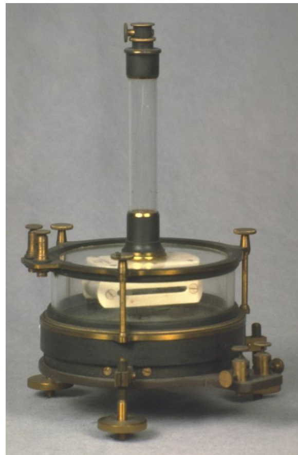
Fig. 7. Nobili galvanometer