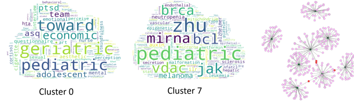
Fig. 3: TF-IDF weighting schemas with K=8 . Word-clouds of Cluster0 and Cluster7 (Left) and graph visualisation using the top-40 frequent words (Right)

HEALTH with (i) a querying engine able to assign topics to a new document using the generated LDA models.