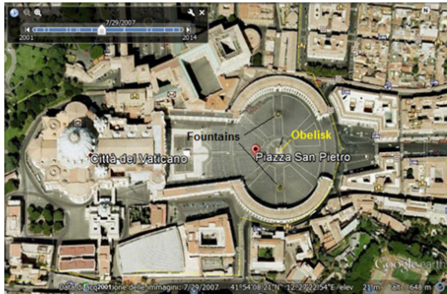
Figure 1: Piazza San Pietro and Basilica. Note the oval part of the Piazza, with obelisk and two fountains.