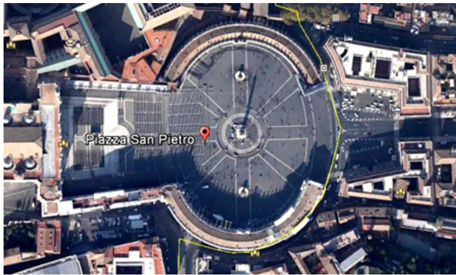
Figure 4: During the winter, at noon, the obelisk is casting its shadow on Maderno's fountain, whereas the shadows of colonnade statues move near the southern fountain of the oval (Courtesy Google Earth).

Let us look at the satellite image shown in Figure 4. It was taken on November 10, in the early afternoon. The noon altitude is 31^\circ , whereas at the winter solstice it is 25^\circ (sollumis.com). We see that the shadow of the colonnade is just about to touch another element of the oval, the southern fountain. As told in [19], Bernini had constraints from existing structures. He had, besides the obelisk, a granite fountain made by Carlo Maderno (1556-1629) that stood to the northern side of it. Bernini made this fountain appear to be at a focus of the ovato-tondo (see Figure 2), matching it on the other side with another fountain. Note that at noon, during the winter, the obelisk is casting its shadow on Maderno's fountain.