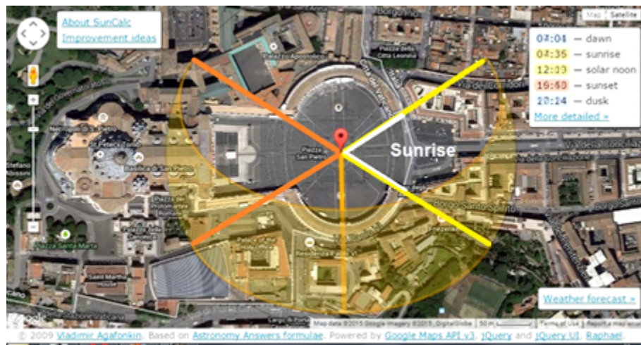
Figure 3: SunCalc applied for the analysis of Bernini's oval, using the obelisk at the center of Bernini's oval as a pivot. Yellow and orange lines correspond to sunrise and sunset azimuths on solstices. The angle between sunrise azimuths corresponds to the entry end of the colonnade.

If we assume that the ovato tondo is representing the world and the two symmetric arcs the sunrises and sunsets throughout the year, as viewed from the local horizon, the Roman church is imagined embracing the universe as a whole. Let us remember that the word "World" in ancient philosophical context had the meaning of "Universe". Moreover, the Roman Church is "Catholic", that is, literally "universally accepted," from Latin catholicus "universal, general," from Greek katholikos, "on the whole, in general".