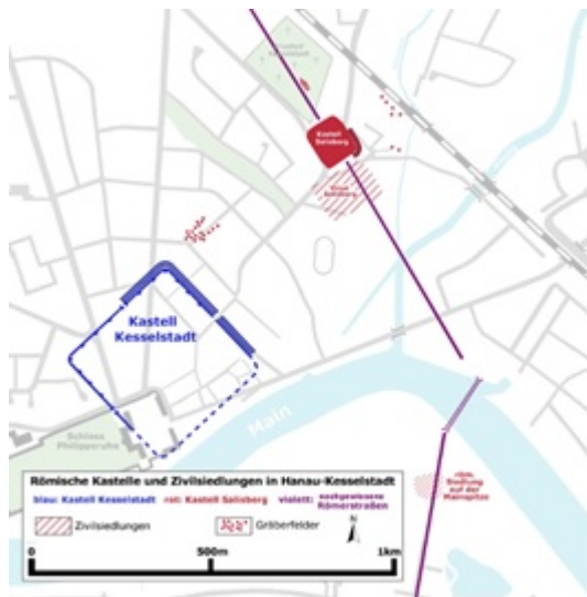
Figure 1 - The Roman fort

As told in [20], the Jakob-Rullmann-Strasse corresponds essentially to one of the main streets of the fort. Let us consider this street as the old Decumanus, in order to investigate the possibility of a solstitial orientation of Kastell Kesselstadt (actually the Figure 1 is suggesting an orientation towards the oriens aestivalis, that is, the northern sunrise on summer solstice). To verify this orientation we can use some software applications which can give us information about time and azimuth of sunrise and sunset. Very useful are those applications that are showing solar azimuths on satellite images: among them, we have Sollumis at sollumis.com and SunCalc at suncalc.net that we have largely used in the previous works on the Roman towns. Here we use SunCalc. First of all, let us see the orientation of Jakob-Rullmann-Strasse: the result is given in the Figure 2.