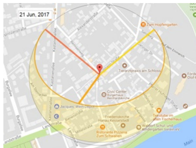
Figure 2 - Thanks to SunCalc.net, we can see that the direction of sunrise on June 21 is coincident with a part of the Jakob-Rullmann-Strasse. The yellow line represents the direction of the sunrise, the red one that of the sunset. The orange arc shows the apparent motion of the sun in the sky.

As told in [20], the Jakob-Rullmann-Strasse corresponds essentially to one of the main streets of the fort. Let us consider this street as the old Decumanus, in order to investigate the possibility of a solstitial orientation of Kastell Kesselstadt (actually the Figure 1 is suggesting an orientation towards the oriens aestivalis, that is, the northern sunrise on summer solstice). To verify this orientation we can use some software applications which can give us information about time and azimuth of sunrise and sunset. Very useful are those applications that are showing solar azimuths on satellite images: among them, we have Sollumis at sollumis.com and SunCalc at suncalc.net that we have largely used in the previous works on the Roman towns. Here we use SunCalc. First of all, let us see the orientation of Jakob-Rullmann-Strasse: the result is given in the Figure 2.