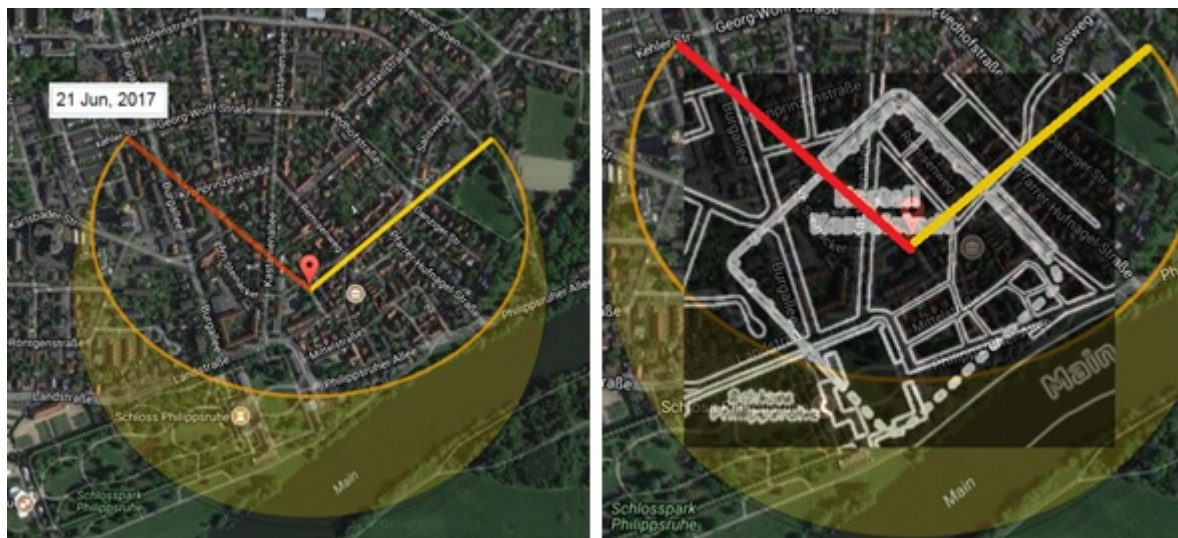
Figure 3 - Using the SunCalc simulation on the satellite map and the Figure 1, we can have SunCalc applied to the Roman fort as in the right panel.

From the Figure 2 we can see that a part of the Jakob-Rullmann-Strasse is oriented along the sunrise on the summer solstice. In the case that this part of the street is also a part of the main street of the Roman town, we can argue that the town had a solstitial orientation.