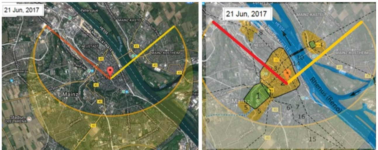
Figure 5 – Using SunCalc, we see that the axis of the fort and of the civil town is oriented along the sunrise on the summer solstice.

Kastell Kesselstadt and Mogontiacum have an evident strategic position, which is conditioning their orientation. However, as we have seen using the SunCalc software they had also a solstitial orientation. Probably, they were deduced with this specific orientation to add a symbolic meaning to the site, linking the fort to the period of the year when the sun is more powerful and strong, that is, "magnus", perhaps in honor of the god of the "might" personified.