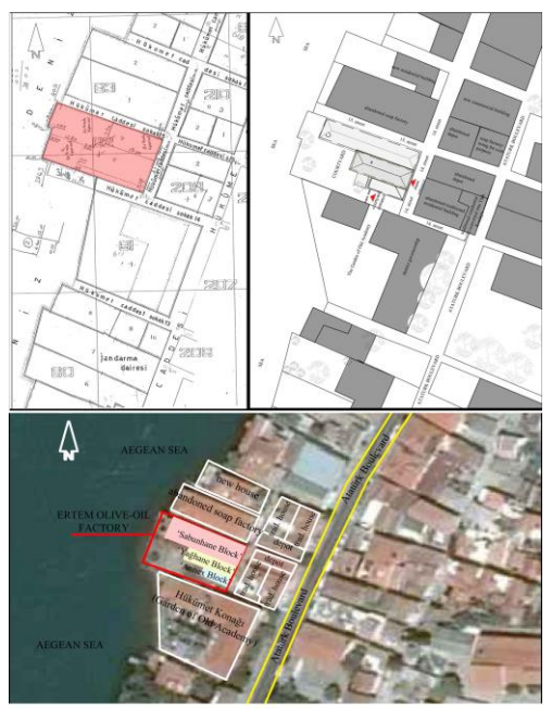
Figure 4 : Top Left: cadastral plan (obtained from municipality); Top Right: site plan (prepared by the author, 2016), Bottom: physical layout of the building (Google Earth image, 2016 is digitally manipulated by the author)