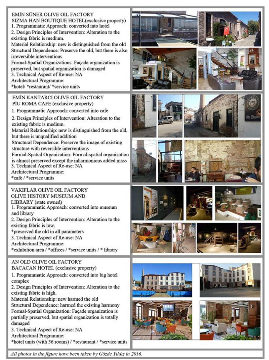
Figure 2: Selected Ayvalık Adaptive Re-use Examples for the evaluation of the site within the scope of the study.

From the programmatic point of view, it can be said that most of the examples make a contribution to the site in order to provide the sustainability. Moreover, the intention of giving the museum example (Formerly, Vakıflar Olive-Oil Factory) is to understand the site demands towards developing a conservation approach for Ertem Olive Oil Factory. Because, while giving a function as museum, the necessity of it for the site should be analyzed. Thus, in Ayvalık, there is a museum of olive history that one can see the production processes, primitive and 19th-century processing tools, information about family enterprises. In addition to Olive History Museum, there is also Rahmi Koç Museum in Cunda (Formerly, Taxiarchis Church).