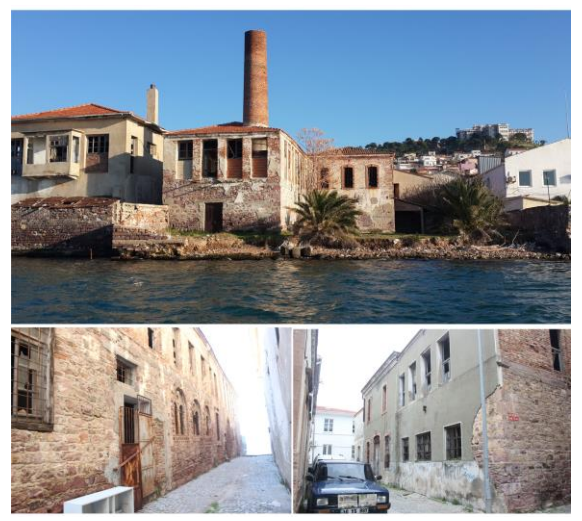
Figure 3 : Ertem Olive Oil Factory, top: view from the sea; bottom left: the most elaborated façade; bottom right: entrance façade

Ertem Olive Oil Factory (See Figure 3) is one of the industrial heritage buildings in Ayvalık dating back to 1910 constructed before the population exchange -1923- by a Rum named Anastasyos Yorgolos (Efe et al., 2013: 65). The factory was used by several owners for producing olive oil and by-products. In 1952, the ownership of the factory took over to Ertem Brothers who give the name to the factory itself. Ertems who immigrated from Crete in 1924, was settled in Ayvalık after the population exchange. They were one of the important families that come from olive trade originated family and they operated the factory until 2000 (Efe et al., 2013: 65). Today, the ownership of the factory belongs to a Turkish Doctor who lives in the USA. It is abandoned and under the risk of destruction due to the factors of human and nature since 2000.