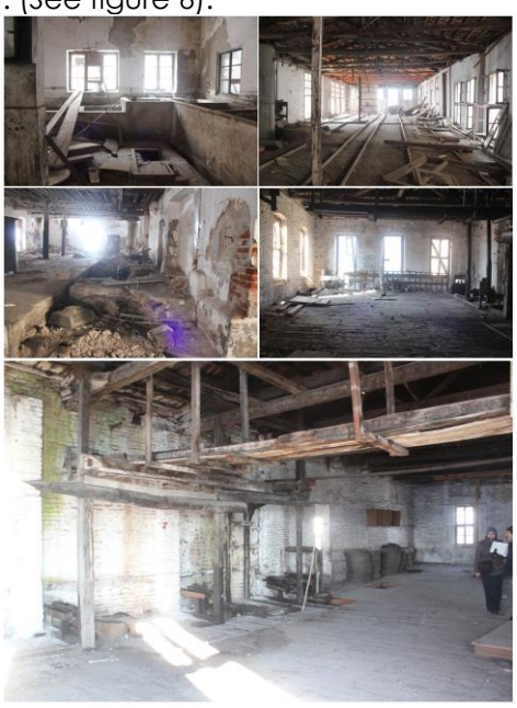
Figure 6: Ertem Olive Oil Factory

'3rd Block' of the factory named as 'Annex Block', has rectangular plan type which is two-storied block. It is 5.5x14.9 m in plan dimensions and 6.15 high from the ground level. '3rd Block' is the part of the factory that added lately as a storage for productions and resting places for the workers. It is a reinforced concrete structure that was articulated to the '2nd Block'. The entrance is provided to this block from the ground floor of it. Access to the first floor of this block is provided through a concrete stairs located in the courtyard adjacent to '2nd Block'. (See figure 6).