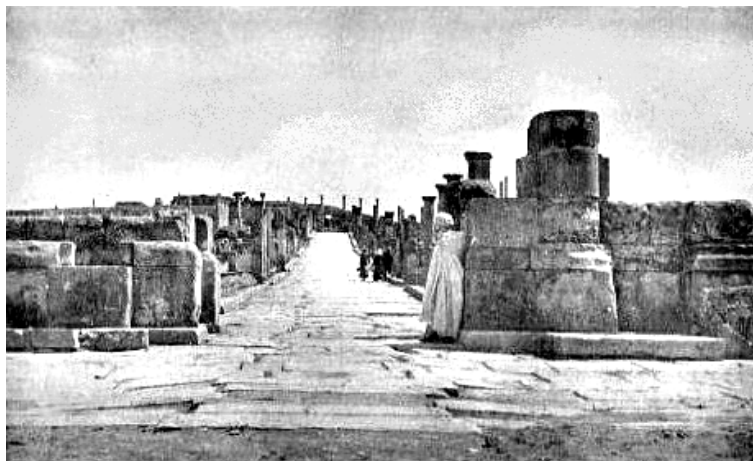
Streets of Timgad, from a photograph in [2]