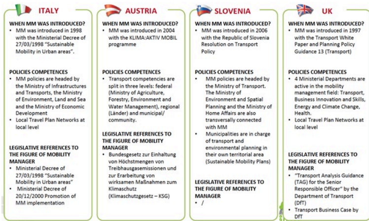
Fig. 1.1 – National contexts comparison

The situation between the various Countries considered is very different. In some Countries, the Mobility Management has long been part of the National legislation (as in Italy and the United Kingdom), which also provides a direct reference to the figure of the Mobility Manager. In other Countries (such as Austria and Slovenia), however, Mobility Management is considered in a more general sense, implicitly included in references to transport, sustainable development and planning as shown in Fig. 1.2 .