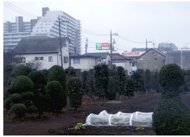
Farmlands within the urban fabric of Nishi-Tokyo.

cities and human settlements inclusive, safe, resilient and sustainable) (UN, 2015). The debate about the UN New Urban Agenda (2016) enlightens that decision making is made in urban areas, as long as urban population is the majority. Land use planning is one of the outcomes of decision-making processes, usually carried out by "urban" experts, which should be aware of the existence of specific resources, values, and interests of rural population, as well as of the fact that urban population need food supply and other services provided by rural areas. In addition, our life depends on resources provided by natural areas, without inhabitants and without voices.