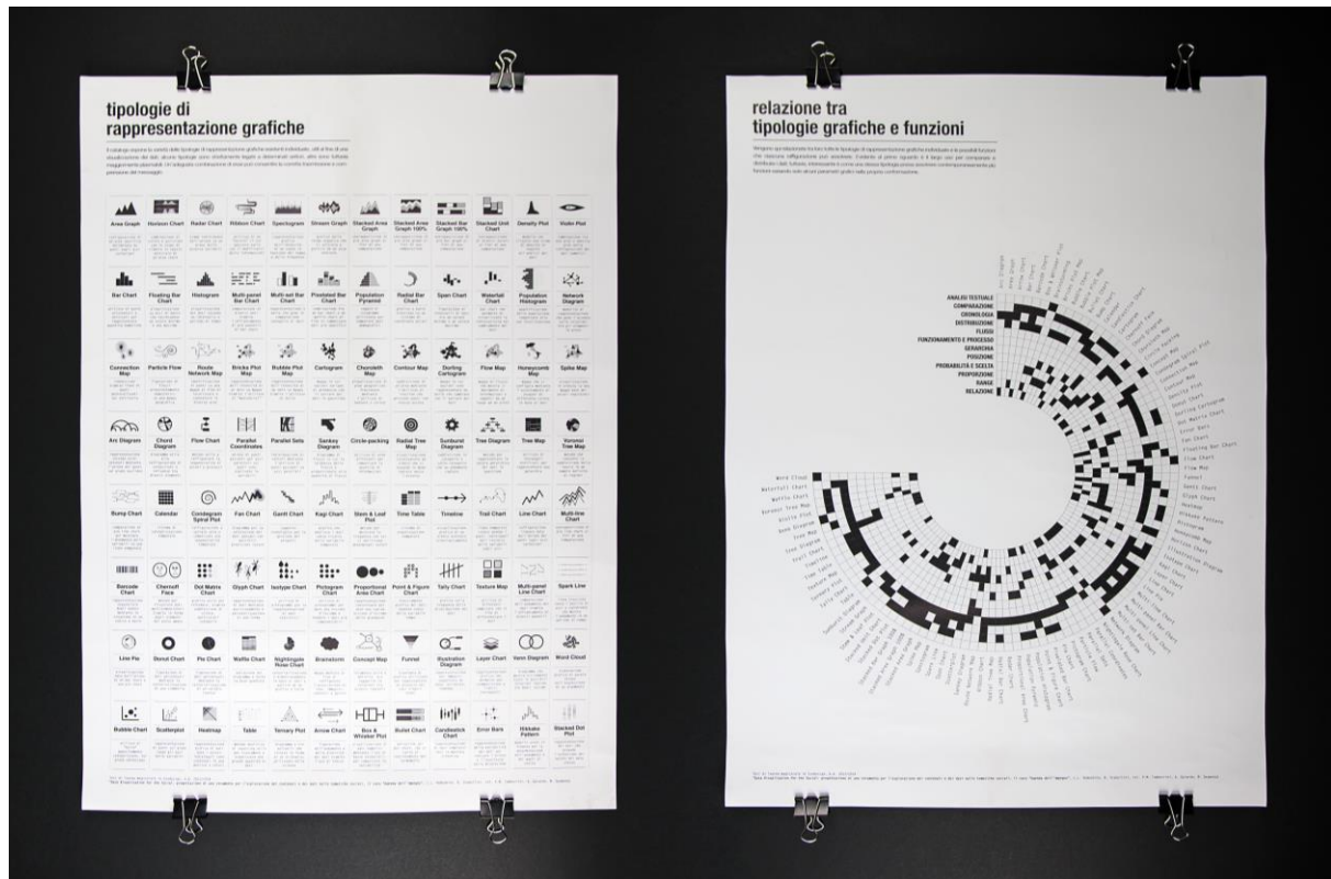
Figure 1. Collection of the types of representation and their functions.

Except for particular type of representations, the other ones can be used for different kind of data; nevertheless, it remains essential the right choice of the graphics in order to achieve the graphical excellence which consists of complex ideas communicated with clarity, precision, and efficiency. (Tufte, 1983; Cairo, 2013).