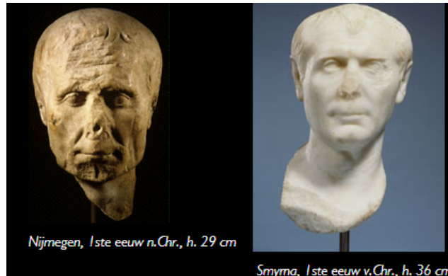
Figure 1: The two Caesar's heads in Leiden, as we can see in [10]. Let me stress that these images are here used only for scientific and cultural purposes.

Actually, at the web page https://elud4.postimees.ee/4509811/video-3d-busti-kohaselt-ei-olnud-julius-caesar-just-ilus-mees , we have a front view of Maja d'Hollosy reconstruction. So we can use it for a comparison, as given in [9], where it is shown that the Tusculum bust proportions were not properly considered.