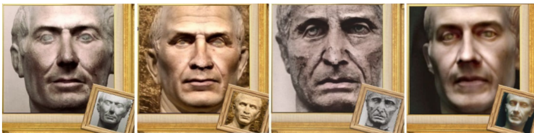
Figure 3: Caesar from Tusculum, Arles, from the private collection, and Pantelleria, processed by means of a “morphing” from site In20Years.com, which makes a face looking older of about twenty years (about the morphing of faces, more details are given in [12-14]).

Let us note that the Tusculum bust is considered the more ancient and faithful portrait of Caesar. After its discovery, also the Arles bust was proposed as a portrait of Caesar. Because of the period of time it was sculpted, the Arles bust could be a faithful portrait too. For the Pantelleria bust, see more details at [20]. In this remarkable work by Francesco Carotta [20], it is discussed in detail the Tusculum head and the best perspective we have