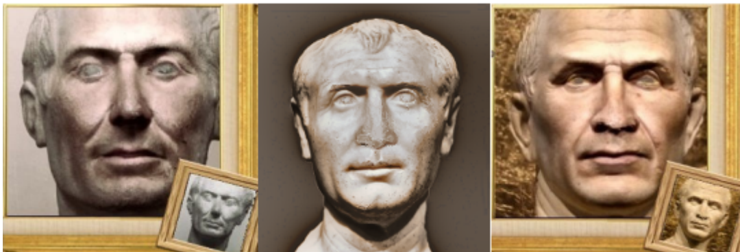
Figure 4: The Leiden portrait, restored, between the Tusculum and the Arles portraits.

Now, let us consider the head of Caesar, that we find in Leiden (Figure 1 on the right), and restore it digitally. Let us consider the result of the restoration between the Tusculum and the Arles portraits (see the Figure 4). As we can easily see, there are common features among these images. As a conclusion, we can tell that this is the Leiden bust which is better to consider for any reconstruction, not that used in [2]. Let me stress once more that I am not able to find any possible reason to use a heavily damaged head for the reconstruction.