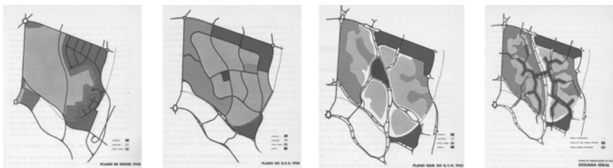
Figure 1. Evolution of Chelas' urban plan between 1948 and 1964

This layout was changed in a second and a third plan, Plano de Urbanização de Lisboa (Plano Director do Gabinete de Estudos de Urbanização) in 1959 and Plano-Base do Gabinete Técnico de Habitação in 1962. During that period a great migration from the countryside caused overcrowding in the historical centre. This situation led the technicians of GEU and GTH to design Chelas as a new urban pole for the eastern part of Lisbon.