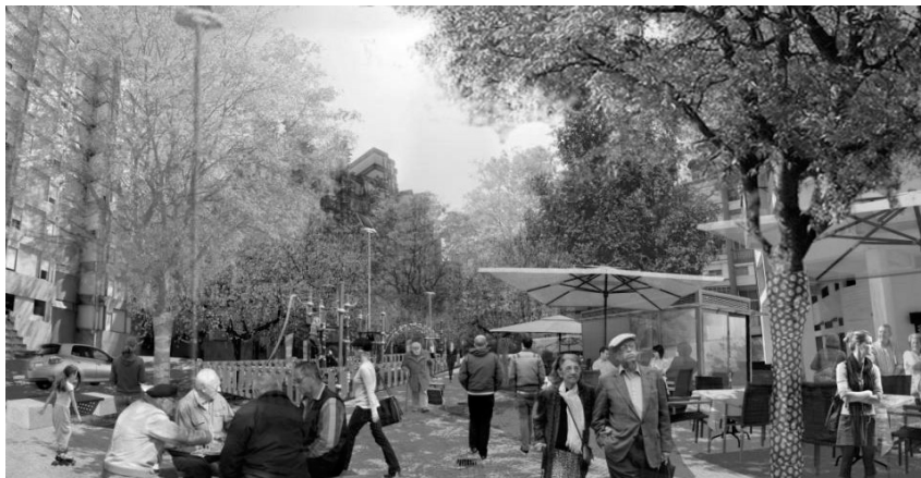
Figure 5. Viver Marvila, program of rehabilitation in Zona I

The program Viver Marvila, organized by the Câmara Municipal de Lisboa (CML) and the Instituto de Habitação and Reabilitação Urbana (IHUR) in 2008, aims to work with the population of Chelas for the redevelopment of the buildings and the public spaces ( Program of Integrated Intervenção , 2013). The association is composed by architects and sociologists who carry of the instances of the local population in order to drive the actions of municipalities in Chelas. The program integrates social actions and urban regeneration operations. The residents' participation is necessary, but the public investment (in sense of financial operation, organization, designs and planning) is essential. The interventions with a major impact were realized in 2008 and 2009, when part of the buildings of the architect Tomas Taveira, known as “Corredor da Morte”, was demolished and the public spaces in the neighbourhood was upgrading. Starting from this point, many other small operations have been realized inside the neighbourhoods, such as the creation of pedestrian areas and the maintenance of the buildings. At the same time, the program Viver Marvila intervened also in the areas outside the neighbourhoods, in fact during the last three years, sixteen hectares of land were planned for urban gardens and a skate-park was created ( Program of Integrated Intervenção , 2013). These actions are also linked to social initiatives in order to help the vulnerable population of Chelas.