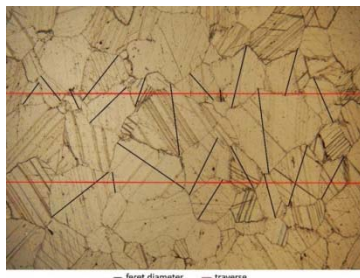
Fig. 2 Linear traverse method for determination of the grain size distribution

indicates a low level material. Is important to highlight that, according to the standard, this classification is valid only for calcitic marbles.