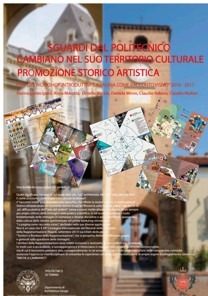
Figure 5. Presentation poster of the workshop's outcomes for Cambiano. In the background there are two architectural portals representing Politecnico and the historical center of the city. On the foreground there are details of the promotional panels and promotional brochures of Cambiano.

Further decoration elements are differently oriented panes (almost a dynamic game) showing many glimpses of the city, while in the center you can see the map with the urban paths. Of particular visual importance is—in the first square on the left—the skyline of the city, a strong sign precisely for its synthetic way of describing a unitary image of the places. The overall icon of the poster is therefore composed of so many smaller images, correlated with each other, and confirming one of the main rules of graphic composition.