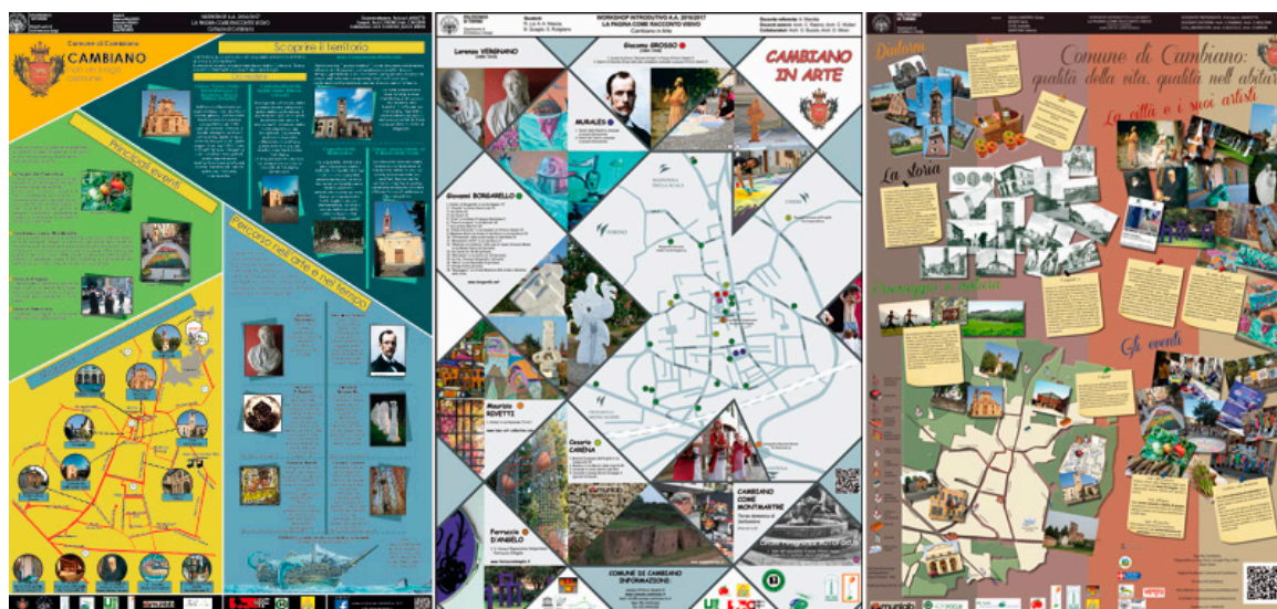
Figure 1. Three of the four promoting panels of Cambiano’s cultural heritage. They show the places of greatest historical interest, the characterizing events of the country’s culture and the artistic works disseminated on the territory.

Subsequently, territorial realities have been involved in the artistic and cultural promotion of the city: historians, artists, playful/cultural associations, traders and the municipal administration as well. Another decisive phase was the presentation to the citizens of Cambiano of the compositions, in a convincing spirit of sharing: from the “objective” information to the more evocative images, as those derived from the historical memory of the city.