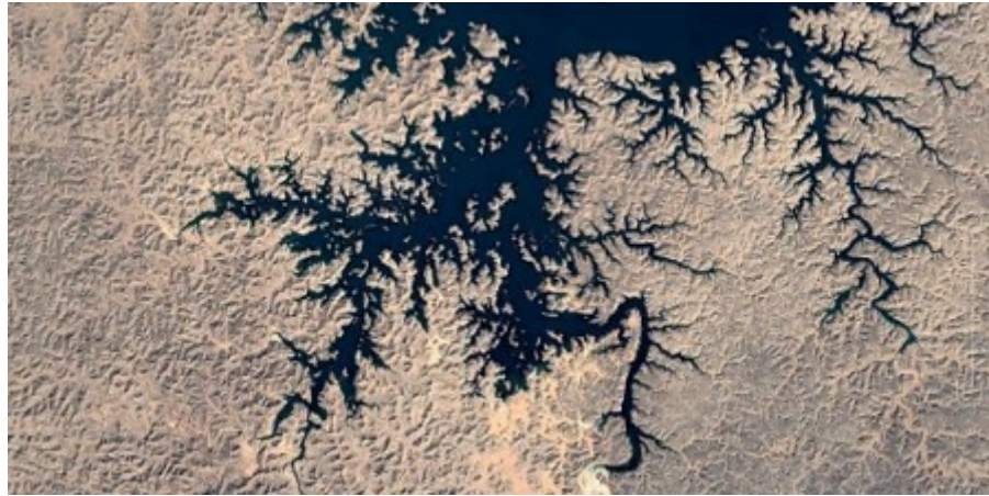
Figure 1: A part of Lake Nasser in Google Earth imagery.

previous article [11], we considered this lake for giving a recurrence plot of its level from altimetric data).