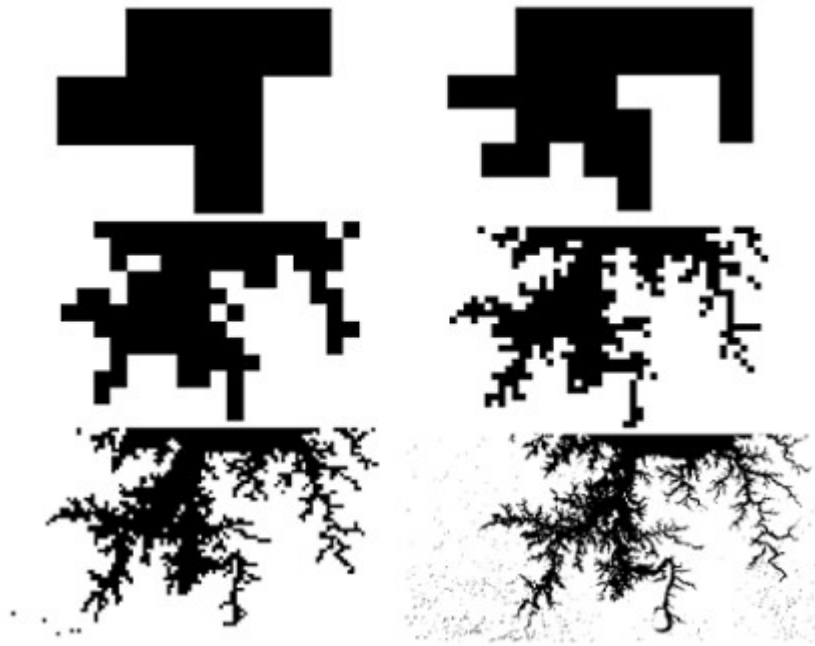
Figure 2: Using the Pixelize filter of GIMP we have a series of binary images that we use for evaluating the fractal dimension of the coastline.

Using GIMP, the GNU Image Manipulation Program, and in particular its Pixelize filter ( https://docs.gimp.org/2.6/en/plugin-pixelize.html ), we can render the image in the Figure 1 as a series of images composed by large color blocks. Figure 2 shows them in binary images, made of black blocks in a white background. Therefore, by means of GIMP, we have a series of binary images suitable for the experimental evaluation of the fractal dimension of the coastline. Our “sticks” are the sizes of the blocks in the Pixelize filtered images.