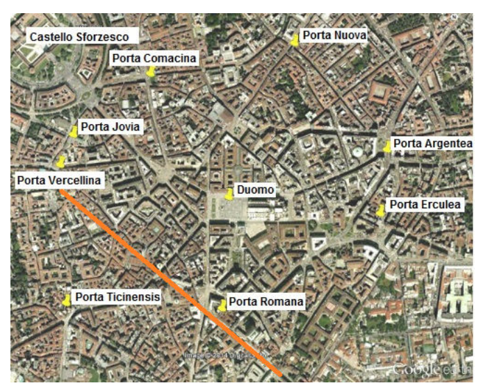
Figure 1: The gates in the walls of Mediolanum, the Roman Milano. The orange line is representing the Decumanus. Note that the medieval cathedral of Milano, the Duomo, has a perfect east-west orientation.

Mediolanum had defensive walls surrounding an area smaller than the actual Roman town. Many houses, streets, monuments and civic services, such as the amphitheatre, were outside the walls. A moat was surrounding the walls, supplied by an appropriate water-channel network [18]. As told before, this defensive system was built during the reign of Maximian (296-305 AD). Several gates were present in the Maximian wall, each having its name. There were the Porta Ticinensis, on the Roman road to Ticinium, now Pavia, the Porta Romana, on the road to Placentia and Rome, Porta Argentea on the road to Bergamo, Aquileia and the Eastern Empire, Porta Nova, Porta Erculea, Porta Comacina towards Comum and passes across the Alps, Porta Jovia on the road to Novarium (Novara) and Porta Vercellina also on a road leading to Novara and Vercelli [18]. These gates were monumental in size, equipped with towers, arches, etc. In the Figure 1, we can see the locations of the gates on Google Earth. It is clear from the number of the gates that Mediolanum was an important "hub" of northern Italy. Torino for instance, had only four gates.