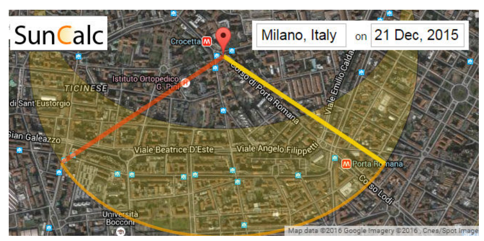
Figure 3: The sunrise azimuth (yellow line) on winter solstice given by SunCalc.net. In the image we can see that this direction is not coincident with the direction of the Decumanus, which is corresponding to Corso di Porta Romana.

In the Figure 3 we can see the sunrise direction on winter solstice given by SunCalc.net. Also Sollumis.com, another software providing sunrise and sunset azimuths and sun altitudes, is giving a sunrise azimuth on winter solstice of 124°.