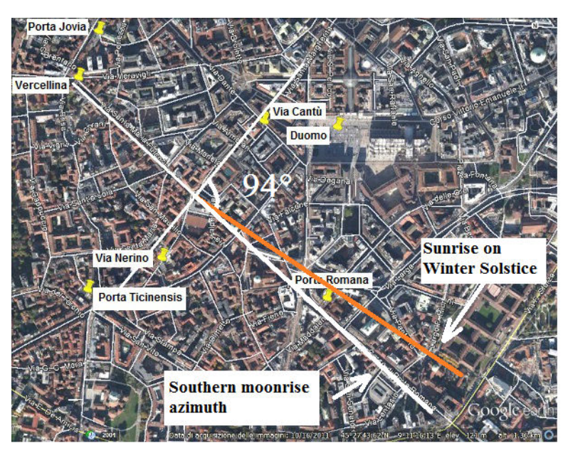
Figure 4: Directions of sunrise on the winter solstice and of the major southern moonrise azimuth. This last direction is coincident to that of the Decumanus.