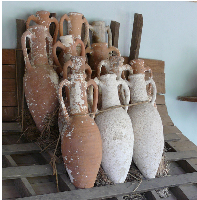
Figure 3: A suggestion on how amphorae may have been stacked on a ship.

An previously told, some amphorae found the mound are still bearing their tituli picti. These tituli were “painted or stamped inscriptions, which record information such as the weight of the oil contained in the vessel, the names of the people who weighed and documented the oil and the name of the district where the oil was originally bottled. ... The tituli picti on the Monte Testaccio amphorae tend to follow a standard pattern and indicate a rigorous system of inspection to control trade and deter fraud” [16]. The procedure was the following: the empty amphora was first weighed, and its weight marked on the outside. “The name of the export merchant was then noted, followed by a line giving the weight of the oil contained in the amphora (subtracting the previously determined weight of the vessel itself). Those responsible for carrying out and monitoring the weighing then signed their names on the amphora and the location of the farm from which the oil originated was also noted. The maker of the amphora was often identified by a stamp on the vessel's handle” [16,17]