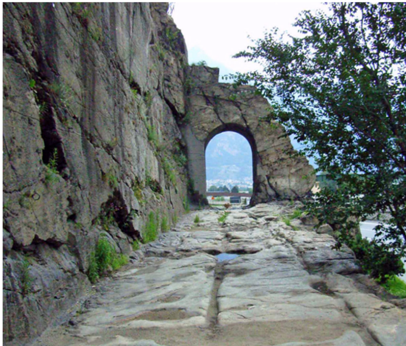
Figure 1: The Roman road to Gallia, near Donnas in Valle d'Aosta. Note the two grooves worn into the road by the passage of wheels.

The Viae privatae, rusticae, glareae and agrariae included private or country roads, originally constructed by private individuals, who could use them also for public transport. Such roads benefited from a right of way. The Viae vicinales were the third category and comprised roads at or in villages, districts, or crossroads, leading through or towards a vicus or village [9].