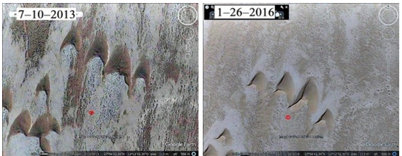
Figure 4: Other barchans (the red circle is the reference point). Here too we can see the faint “ghost” shapes in the image of the right panel.