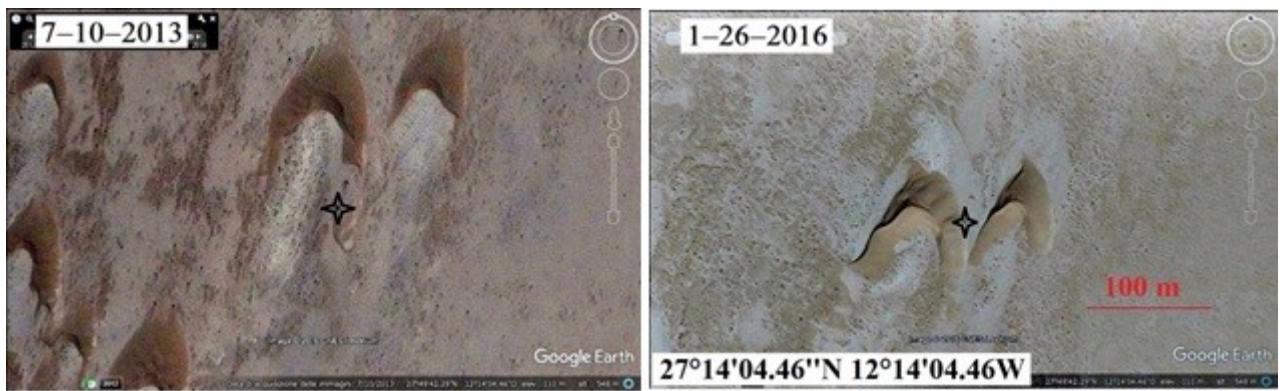
Figure 2: Two barchans in the Laayoune-Sakia El Hamra region. Use the black stars as reference points to compare the images and see the motion of the dunes. They have changed their shape. Note the faint “ghost” image of the previous position and shape of the dunes.