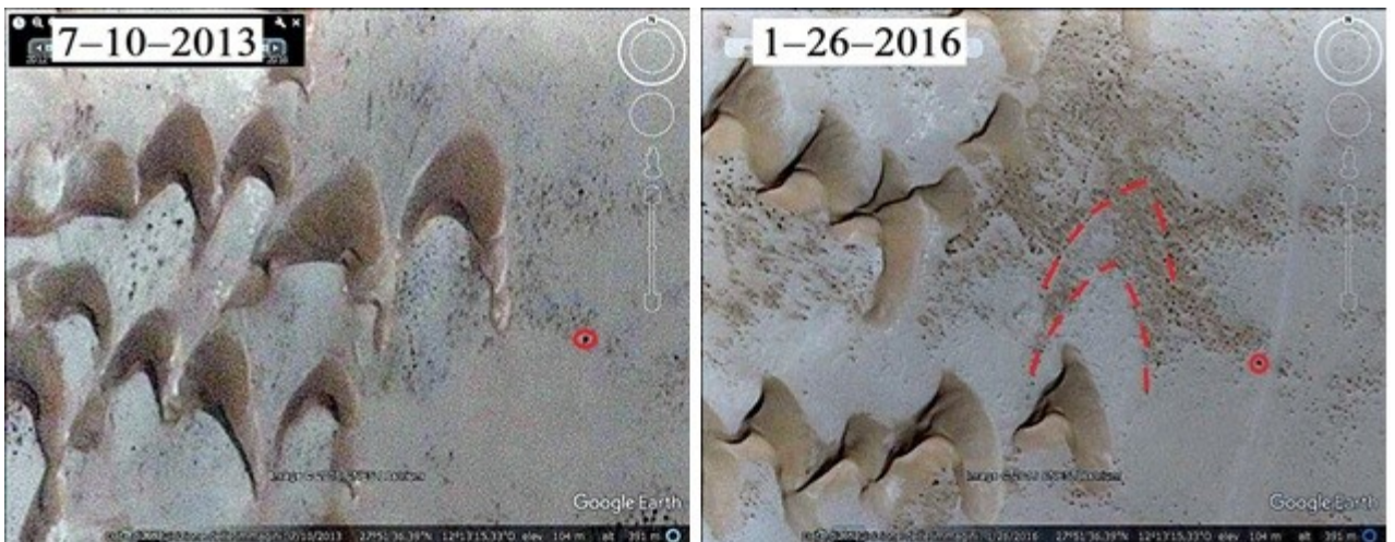
Figure 3: Barchans changed their shapes (the red circle is the reference point). Note the faint “ghost” shapes (marked in red) of the previous position and shape of a dune.