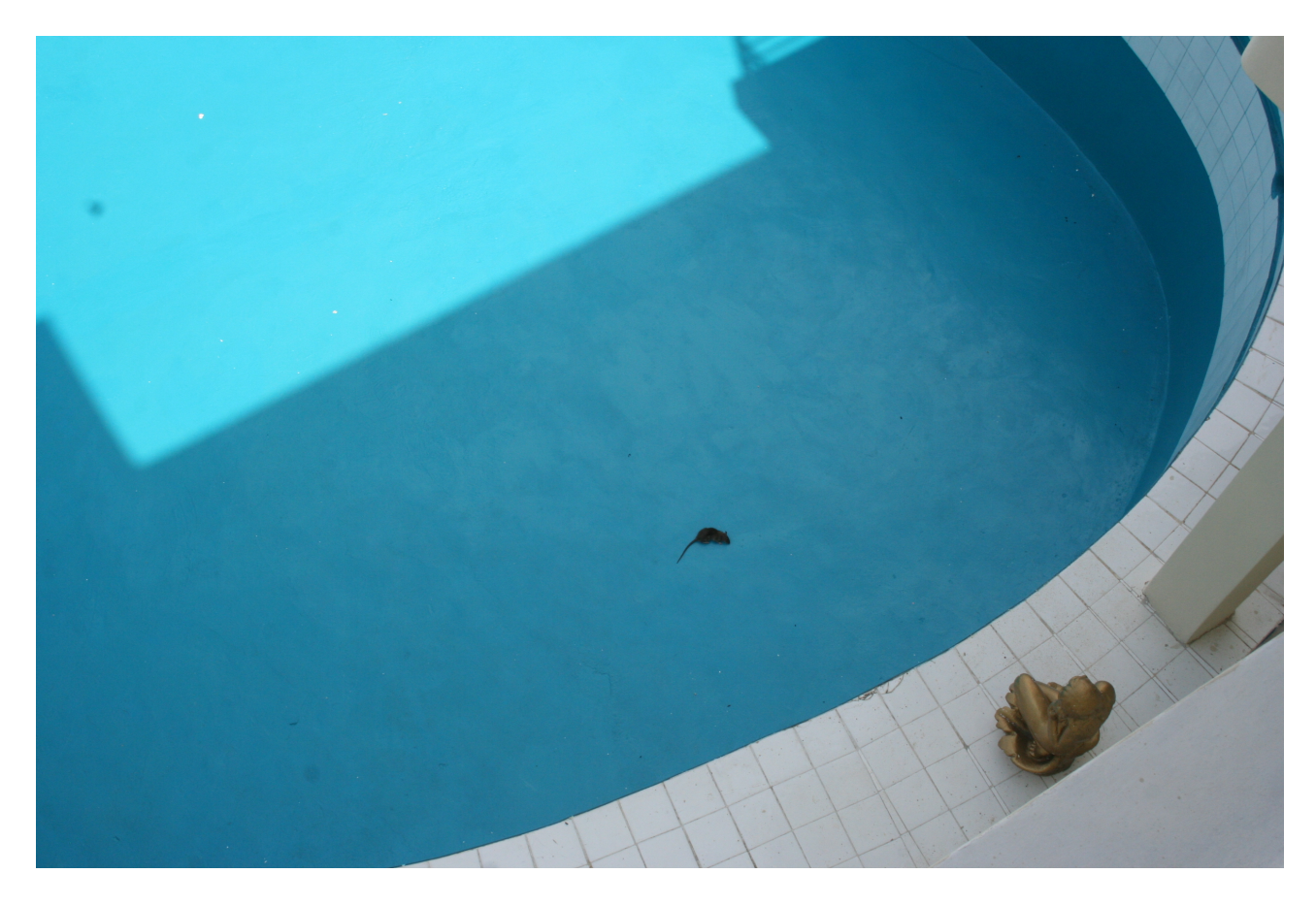
Image 2: Mouse in the pool of the guesthouse, Pétionville, Haiti, October 2010.