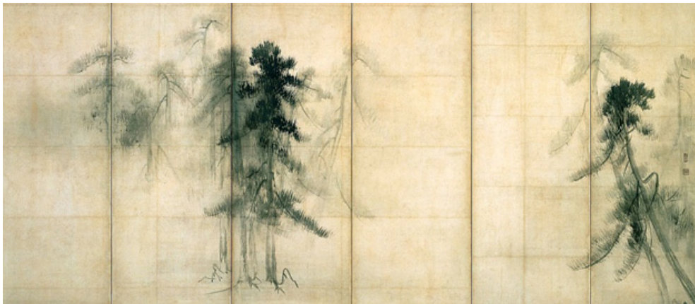
Figure 1: The concept of ma in Hasegawa Tohaku's painting.

Western thought usually talks of space in the three-dimensional meaning compared to something, a tangible object. The concept of ma is not made up of concrete constituent elements; rather it comes from human imagination when man experiments with these elements. Within the development of residential architecture, the central column, originally a structural requirement but which later was attributed a certain symbolic significance, is gradually replaced by outside pillars. The interiors are skilfully connected to the outside via verandas and open hallways, as they are not used to contrast the external elements but to fuse together with them and the surrounding nature. The result is that spatial continuum that so fascinates us, thanks also to the sliding walls and removable furniture. The ma or grey area cannot be recreated simply by turning towards rationalism and functionalism, but this awareness opens the way to new frontiers of symbolism and architectural pluralism. From what we have said, we can infer that in Japanese construction culture space is nothing more than an imaginary quality: it is not the size of the symbols but their reciprocal relationships, their placement within the all. Harmony is the common theme needed to link the concept of spirituality within the architectural complex [3].