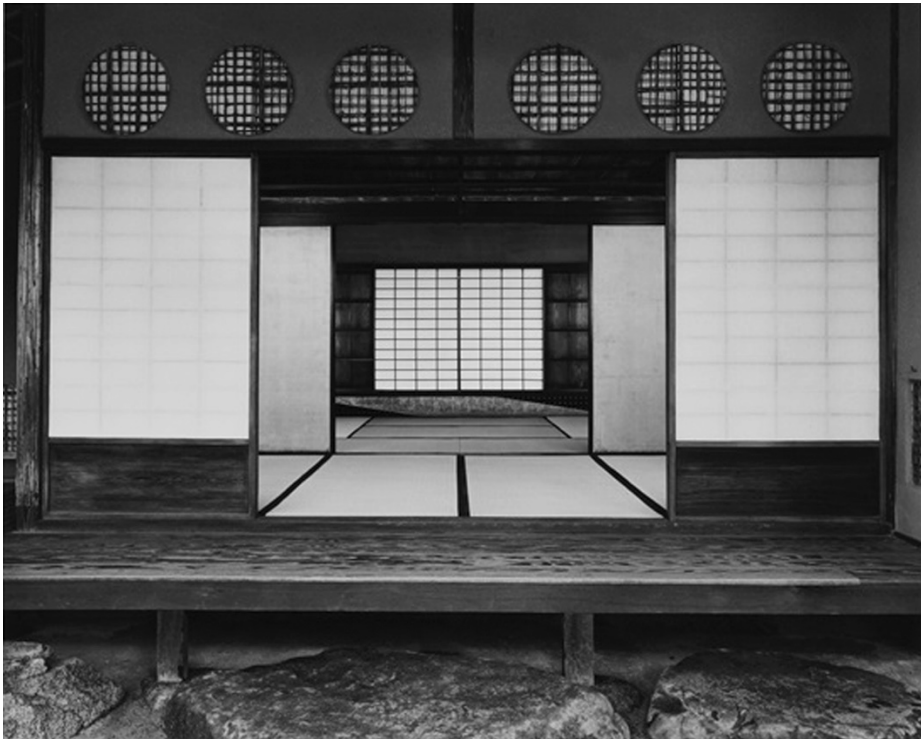
Figure 4: Katsura Imperial villa. Central perspective.

In order to compare the layout of Japanese homes with western houses in general we should think about it on a variety of levels: plans, public/private distinction, design outlines. One of the aspects that characterises Japanese domestic architecture is the lack of a clear distinction between interior and exterior. There is no physical border in the typical western home, but it is often surrounded by a garden, while the Japanese home is not confined to the immediate border but more around the entire property. The Japanese house is not closed off so markedly, the division between the public and private space is not as clear as in the western home, where it is easy to see whether you are inside or outside the house (Fig. 5).