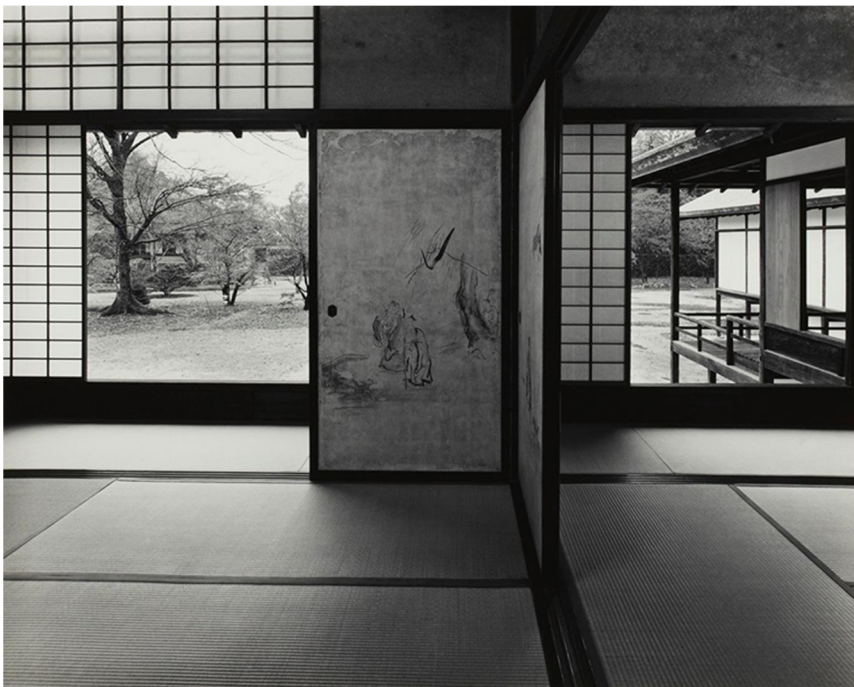
Figure 3: Katsura Imperial villa. Inside view into the garden.