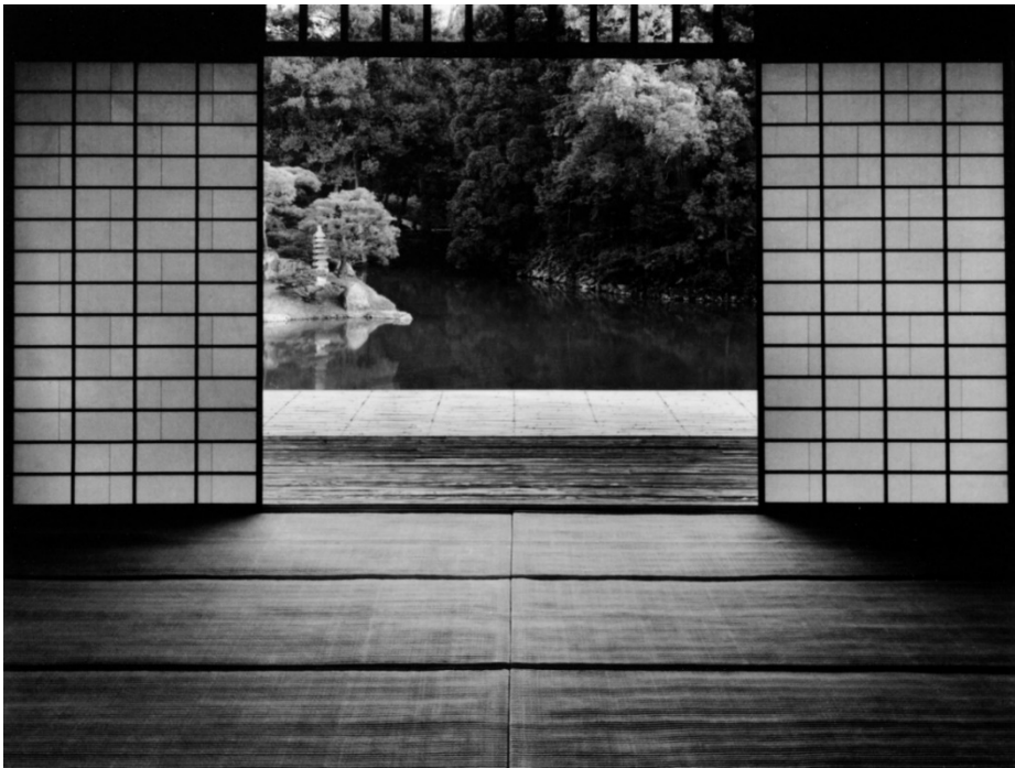
Figure 5: Katsura Imperial villa. A garden view.

The first sensation we have of the Japanese home is a lack of privacy: barriers do not give an actual sense of security, but have to allow light to filter through. Japanese keep their privacy through distance: thanks to the use of removable doors it is possible to create several environments to separate the more public areas of the house from the family's more intimate rooms. The western garden is often seen from the outside and the house itself is seen in the background. The Japanese one is supposed to be viewed from inside the home and designed in harmony with the rooms that surround it. This difference in perspective is indicative of the other conception that Japanese architects have of the perception of the home. Japan has been a source of inspiration for some of the most important architects in the history of architecture, starting from the Modern Movement to the contemporary period. What most attracted western architects was the minimalist conception of Japanese architecture and the close relationship between nature and tradition constructions. Among them, mention must be made of one of the major players in the Modern Movement, Frank Lloyd Wright, who, having lived in Tokyo for a period, came into direct contact with Japanese culture. Wright wrote the following in his famous autobiography on his passion for the Japanese world: