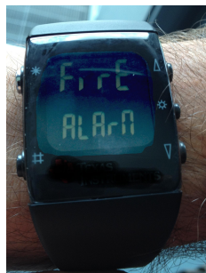
Figure 2: A loud message

Reply messages encompass all messages for which a user reply is required, typically in form of a YES/NO answer. They are the highest priority messages exchanged by the watch and the Aml system, and they always require user attention by activating the watch alarm. Possible replies are YES (“▲” button), to activate the suggested action or NO (“▼” button) to avoid it. Any other button pressure is interpreted as don’t care.