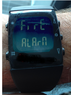
Figure 2: A loud message

Reply messages encompass all messages for which a user reply is required, typically in form of a YES/NO answer. They are the highest priority messages exchanged by the watch and the Aml system, and they always require user attention by activating the watch alarm. Possible replies are YES (“▲” button), to activate the suggested action or NO (“▼” button) to avoid it. Any other button pressure is interpreted as don’t care.