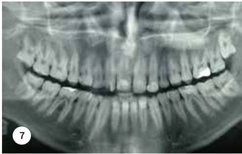
Fig 7 - Pre-operative Panorex