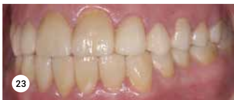
Fig 19, 20, 21, 22, 23 - Definitive restoration in situ , intra-oral view