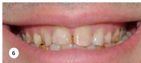
Fig, 1 2,3,4,5,6 - Pre –operative intra-oral view