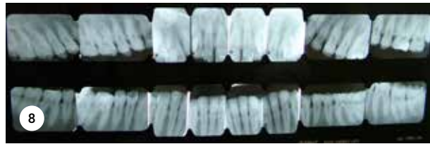
Fig 8 - Pre-operative full mouth ERSE