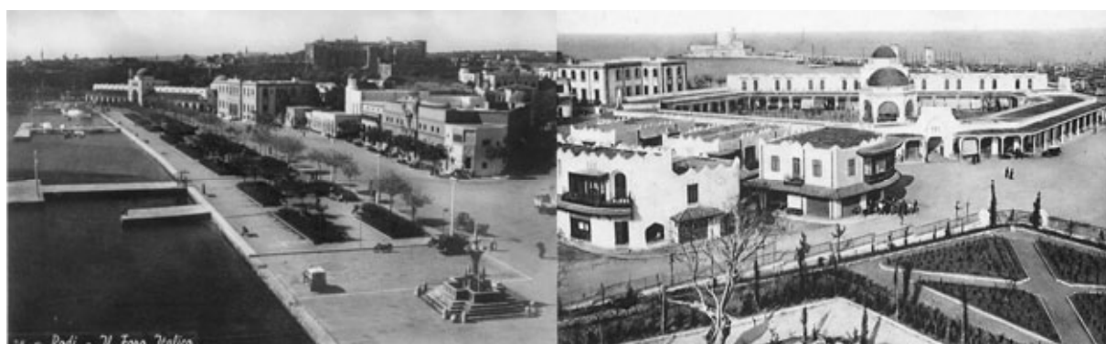
Fig. 7: A view of the "Foro Italico" and the new market [postcards of 1930].