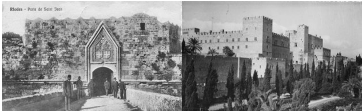
Fig. 9: St. John gate with Hospitaller coats of arms [postcard of 1914] and the restored Magistral Palace [postcard sent in 1956].