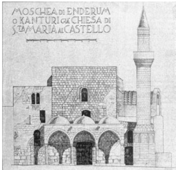
Fig. 4: The Latin cathedral (Kantouri djami) drawn by M. Paolini in 1940 [Presenza 1996, 238].

léthargie profonde»: the harbor of Rhodes was deserted and the Street of the Knights, an essential place to visit, appeared «déserte, remplie d'herbes et de pierres roulantes, [...] un amas de maisons turques ou juives» [Berchet 1985, 331-343]. In 1844, the French orientalist E. Flandin confirmed the state of abandonment of the main religious and civil Hospitaller monuments. Nineteenth-century pictures in travel accounts, in a full orientalist spirit, return us an Islamic town, finding its new fascination in a ruined and decadent architecture (Fig. 2-3).