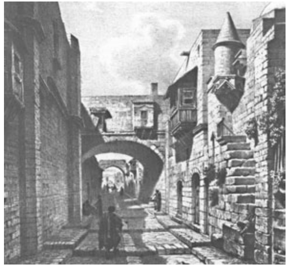
Fig. 2: Street of the Knights [Flandin 1844, n. 19].