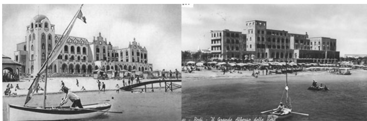
Fig. 8: The "Albergo delle Rose" in its former appearance [postcard after 1925] and after restorations [postcard after 1936].

çarşı; the church of St. John, having the hypothetical forms of the Medieval Conventual church; several barracks and schools, the Bank of Italy, the Post Office and the Puccini theater (Fig. 7). In order to make the town a touristic center, an airport was built and the harbor of Rhodes was renewed. Transformations in the northern end of the island also began in 1933: the nineteenth-century Cretan neighborhood and the Catholic cemetery were eliminated, in order to build a square, gardens, the Institute of Marine Biology and the Albergo delle Rose, together with a second luxury hotel, the Albergo delle Terme. However, despite the 1936 master plan intended to concern the whole suburban area, by integrating the smaller existing villages, the historic town of Rhodes and the new town, only a