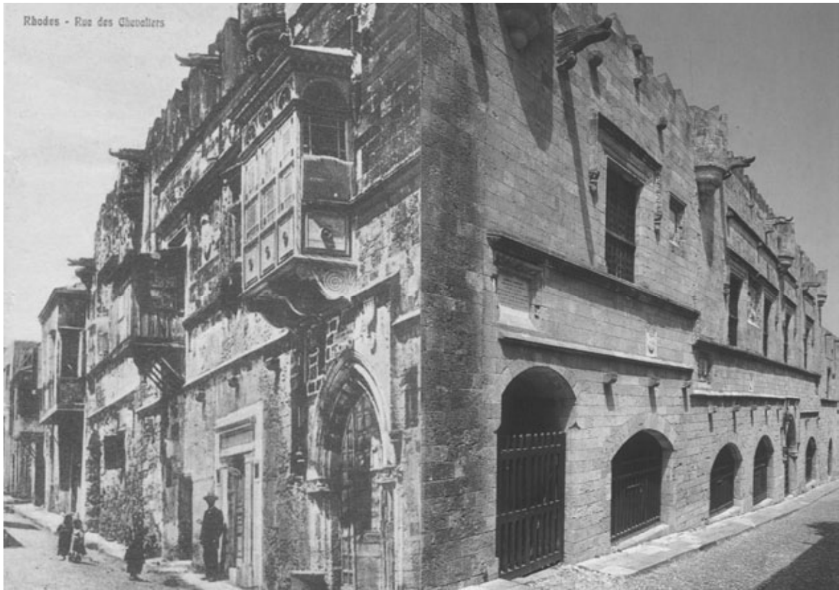
Fig. 5: The auberge of France Tongue before restoration [postcard of 1912] and today [a photo of 2009].

Moreover, those restoration strategies were in accordance with the common practices of the time, aimed at return the stylistic unity of a monument although its original forms were not exactly known. We believe that the most significant matter was the a priori removal of Turkish elements in the civil buildings: other visual elements, in fact, remained and Ottoman buildings were preserved or restored, also because of a large Turkish community in the town [Miglioli, Savino 1987, 167]. Several minarets and ablution fountains, but also some mihrâb, stood out as “foreign” annexes and were often depicted in magazines and postcards (Fig. 6).