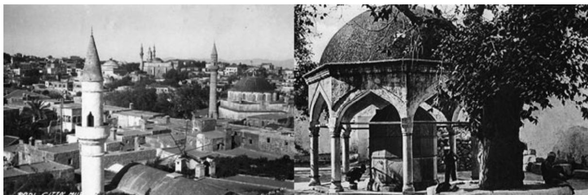
Fig. 6: The urban mosques and an ablution fountain [postcards of 1934].