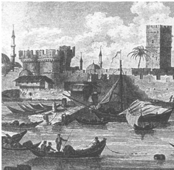
Fig. 3: The commercial harbor [De Choiseul-Gouffier 1783, from http://www.mapmogul.com ].