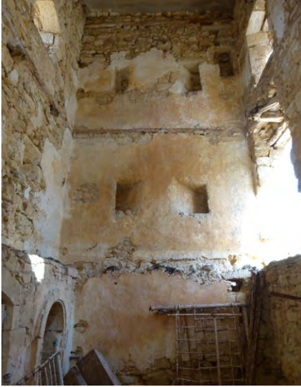
Fig. 9- Tower-house in Giannoudion, interior east elevation (section AA' in Fig. 8) (Emma Maglio, 2014).

The rectangular splays are irregular and somewhere curved, and the plaster prevents any further analysis (Fig. 9).