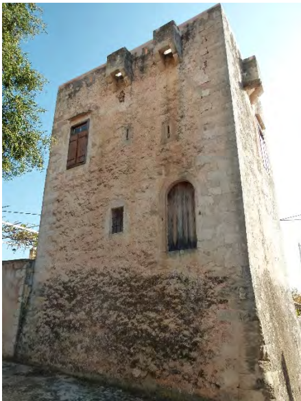
Fig.2- Tower-house in Mouzouras (Emma Maglio, 2014).

The aligned windows and the decorated frames prove the existence of a specific project, and perhaps of more skilled workers.