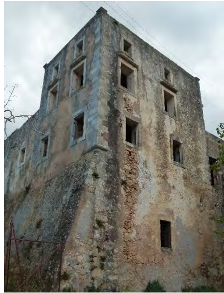
Fig.3- Tower-house in Mikro Metochi (Emma Maglio, 2014).