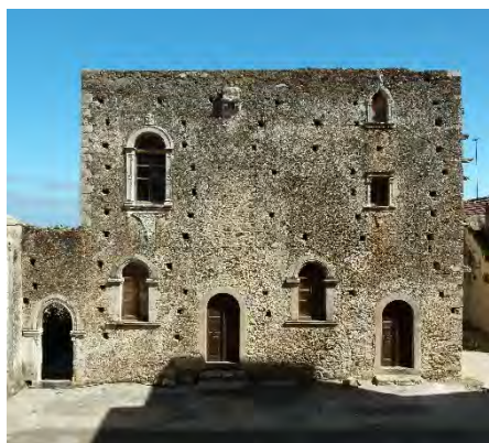
Fig. 4- Fortified house in Roghdia.

In the same prefecture is the village of Maroulas, where four towers survive, some of them restored and others currently abandoned. One of the rare fortified “palatial” houses of Crete, instead, belonged to the Venetian Modino’s family in the village of Roghdia, where it dominates the Iraklion bay (Fig. 4). It dates back to the 16 th c. and was restored by the Ephorate. The building consists of three floors and has its original access at the first one; some arched openings were added, but the presence of loopholes and bretèches proves a defensive use. In the prefecture of Lassithi, several ruined tower-houses are in several villages desertés found starting from the 14 th c. in the Venetian cadastres. Among them, the tower of the Venetian Zenone’s family dates back to the early 18 th c.: it survives until the first floors, where there is a stone fireplace.