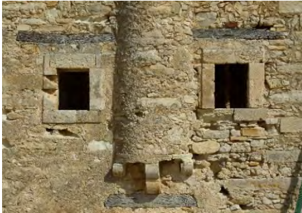
Fig. 7- Tower-house in Giannoudion, west elevation, detail (Emma Maglio, 2014).

different forms and kinds of blocks. In the west elevation, we find three small wooden beams over the discharging arches of the windows and below the fireplace (Fig. 7).