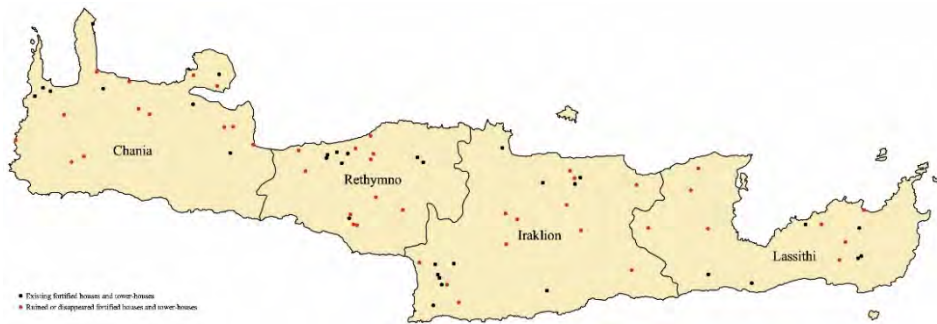
Fig. 1- Identified sites of fortified houses (Emma Maglio, 2015).

34 are in good conditions. Tower-houses are the most common typology: 30 edifices are ruined or disappeared, and 27 survive (Fig 1).