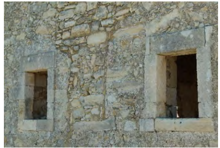
Fig. 10- Tower-house in Giannoudion, exterior North façade, detail (Emma Maglio, 2014).

are in the building. At the second level, the small window flanked by loopholes probably lighted up a warehouse and was also involved in the defense. At the third level there was the real mansion of the lord: we can see a fireplace made with sculpted blocks of white soft limestone. The couples of rectangular windows of the North and South fronts replaced former windows opened up at the center of the façades: one of the current windows reused a part of the jambs of the former window, and we can see traces of reparations in the masonry (Fig. 10, 11).