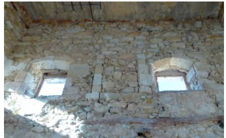
Fig. 11- Tower-house in Giannoudion, interior North façade, detail.

All these windows are rectangular, but the interior lintel blocks on the North elevation have an angled form: this can be frequently found in rural houses of the island. A second type of windows is on the west elevation: two quadrangular openings flanking the fireplace make up a homogeneous whole with it (this is confirmed by the presence of wooden lintels), probably contemporary to the windows placed at the same level on the other façades.