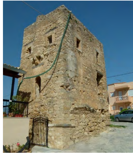
Fig. 6- Tower-house in Giannoudion, west and South elevations (Emma Maglio, 2014).

vault suggests the presence of a horizontal connection with the adjacent ruins. Perhaps a larger complex was situated around the tower, also including a second ruined barrel-vaulted structure that stands to the east of the tower.