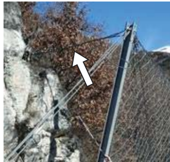
Fig. 2 - Short upstream rope