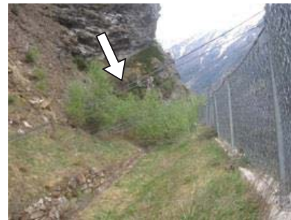
Fig. 3 - Long upstream ropes