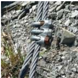
Fig. 1 - Slid clamps