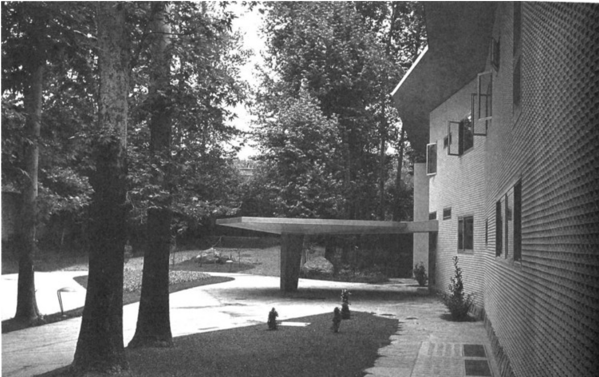
Facade of the Villa Namazee.