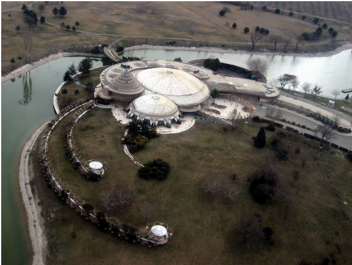
The Pearl Palace in Karaj, Iran.

Many notable mid-century buildings have been neglected in the past decade, including the ornate Sabet Pasa mansion in Tehran, known as Iran's Palace of Versailles, which narrowly avoided being demolished in 2015. And the 1966 Frank Lloyd Wright-designed Morvarid (Pearl) Palace, in the city of Karaj, which once belonged to the Shah's sister, Shams Pahlavi.