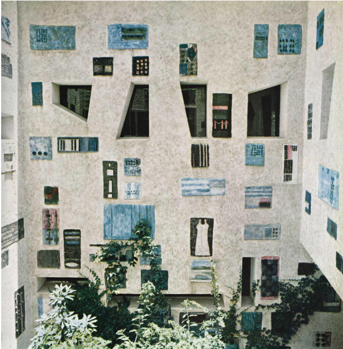
View of the internal courtyard at Villa Namazee.

Villa Namazee is probably the most iconic of all the endangered contemporary structures. Designed by Milan-based architect and industrial designer Giovanni Ponti (1891-1979), one of the leading figures of Postwar Italian modernism (and the founder of Domus magazine), the villa has an open plan, a suspended roof and external openings protected by wide overhanging eaves.