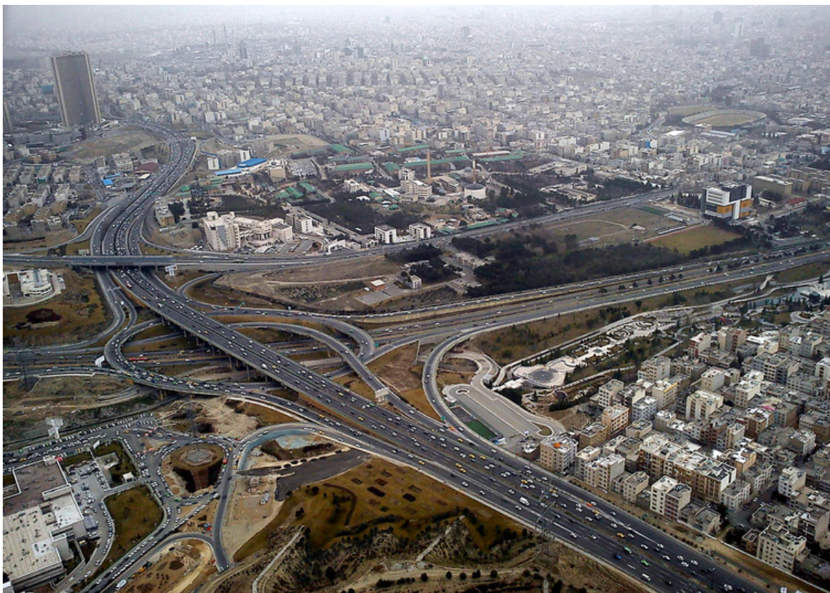
Tehran's American-designed master plan called for a series of residential and commercial areas linked by highways.

Iran’s 20th-century modernisation process coincided with that of many other Middle Eastern countries. Nations such as Egypt Turkey and Iran felt a need to infuse their ancient civilisations with new ideas and influence, including Western infrastructure and educational models.