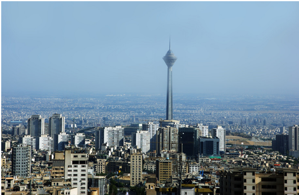
A view of Tehran, with its mix of traditional and modern design.