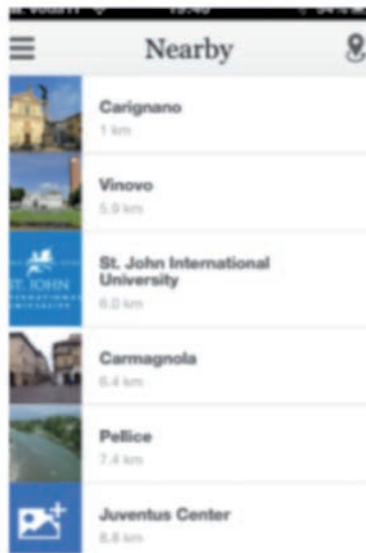
Figure 4. The Nearby feature on iPhone device.

But a true, "intelligent access" has to provide to you information you need, or tailored for you: nowadays, thank to information available e.g. on social networks, particular interests of any visitor can be saved and considered. Not only "where you are" is important, but also "who and how you are", because in the information sea you should find what you are really interested to know. Of course, this goal requires a great work on ontologies that have to cross with "social" data, very heterogeneous: each user has the right to receive "his own" information output.