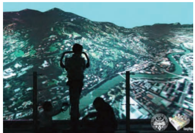
Figure 3. Immersive and interactive virtual reality, at LAQ (High Quality Laboratory) "Auditorium", Politecnico di Torino.

The matter the Authors wish point out, in conclusion, relates to the use of technologies and databases now widely available.