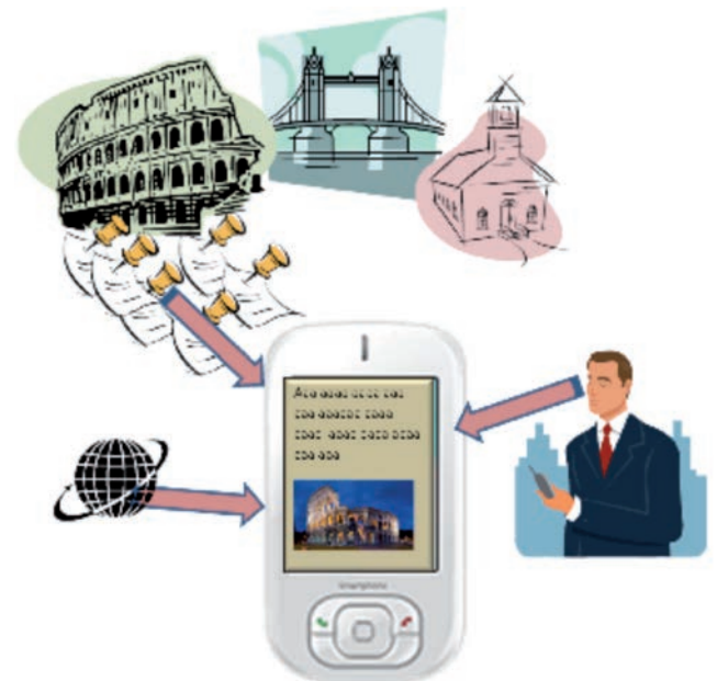
Figure 1. Multiple access to information.

Many projects facing this issue are already been carried out: from simple “virtual books or tables” to particular experiments as PointAt , (These solutions are interactive installations, the first one to consult documents, while PointAt allows to learn more about a digital version of an artwork, just pointing the finger on details - that's a very instinctive gesture (Museo del Palazzo Medici Riccardi, Firenze, 2003)), Museum Wearable , (This small, lightweight computer, in a carrying backpack, was connected to a body motion sensor and to augmented reality glasses and headphones, in order to support and enhance the museum visit (temporary exhibition “Robots and Beyond”, MIT Museum, Boston 2000)), Cave , (An entirely virtual, immersive environment you can visit thank stereoscopic glasses and special “mouses” ( e.g. Kivotos system, Foundation of Hellenic World, Athens 1999)), haptic interfaces, holograms and so on. In these cases, anyway, virtual real-