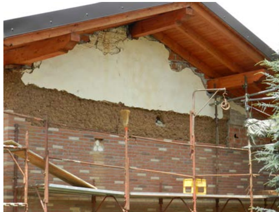
Fig. 3. Application of an external coating on an earthen building in san Giuliano Nuovo, (Alessandria, Italy).

Earthen building techniques have become, since the second world war, a synonym for poverty, marginalization and, for that reason, no longer used for the construction of new architectures and progressively hidden and/or replaced in the older buildings [9] (Fig. 3).