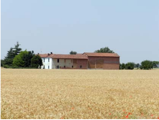
Fig. 1. Cascina Ravazzi in Frugarolo (Alessandria, Italy).

Unfortunately, the earthen buildings, abandoned because they were considered unhealthy and unstable, but, above all, because they were incompatible with the concept of modernity which people aspired to, for a long time have been placed in a situation of great vulnerability and are nowadays often severely compromised [10]. (Figs. 2).