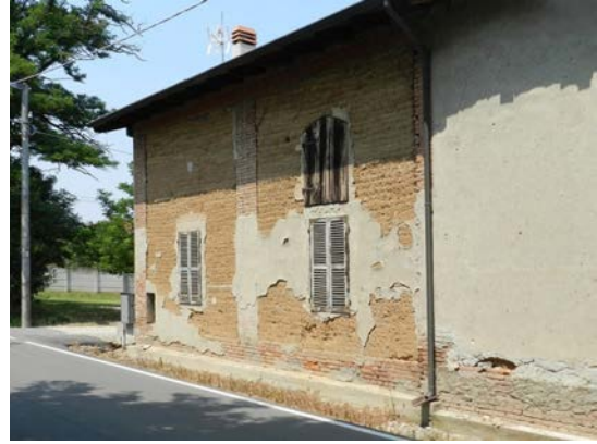
Fig. 2. Urban building in Frugarolo (Alessandria, Italy).