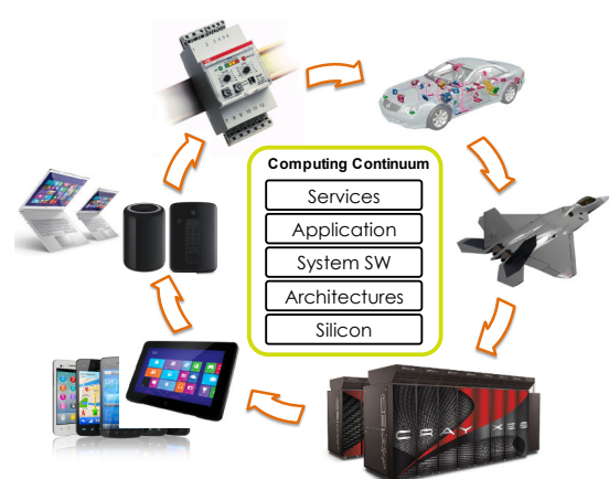
Figure 1: The computing continuum

susceptibility to transient faults (soft errors) and permanent faults (device degradation, wear-out) [2]. One of the biggest challenges for future technologies is the implementation of “dependable” systems on top of significantly unreliable components, which will degrade and even fail during normal lifetime of the chip.