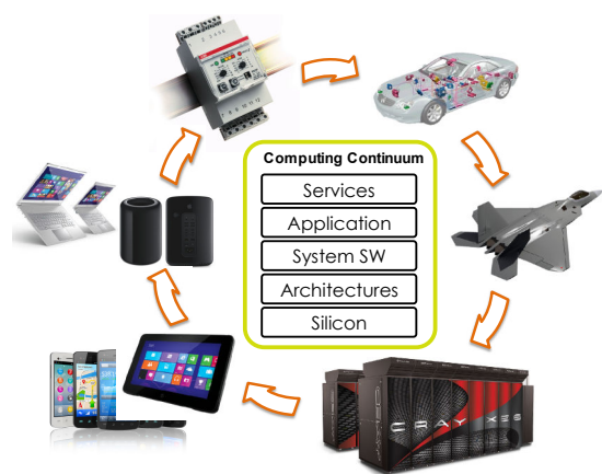
Figure 1: The computing continuum

susceptibility to transient faults (soft errors) and permanent faults (device degradation, wear-out) [2]. One of the biggest challenges for future technologies is the implementation of “dependable” systems on top of significantly unreliable components, which will degrade and even fail during normal lifetime of the chip.