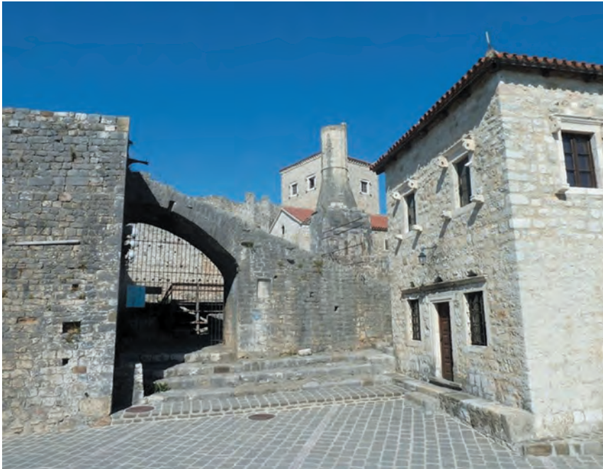
Figure 6: The Cittadella area in Ulcinj.

Today all this area is the city's museum. The church, founded in 1510, in the north area, converted into a mosque by the Ottomans, without changing the typically Venetian characters, contains within it different typical heirlooms: badges, everyday objects, historical maps, decorative elements, jewellery, decorations, etc.