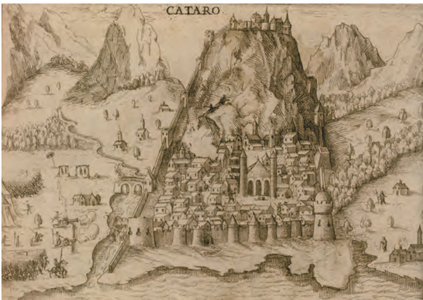
Figure 1: View of Kotor, with the fortress of St John on the top and the massive walls all around the city.

The Kotor walls were built over the centuries, from the time of Byzantine rule, and during the 13th and 14th centuries, they were radically renovated and definitely set as a defensive perimeter of the city.