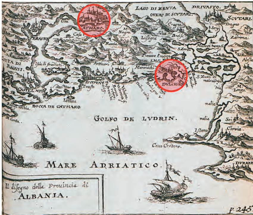
Figure 5: Kotor and Ulcinj, on the Adriatic coast, are here highlighted: they are part of Albania Veneta. Source: J. Von Sandrart, Map of the coast from Kotor, Montenegro to Durrës, Albania , 1687, Gennadius Library – The American School of Classical Studies at Athens.

of immense Cyclopean walls still visible. The town was frequented by Greeks who might have settled their trading centre using the existing port facilities; subsequently it became autonomous municipality with the name of the Roman Olcinium or Ulcinium and played an important commercial role at the crossroads between the hinterland and the opposite shores of the Adriatic, and it so easily acquired the Latin Mediterranean culture. In 1405 the Venetians conquered the town that remained under the Serenissima for 150 years. Under Venetian control, the city was renamed Dulcigno in Italian, and it was incorporated in the Albania Veneta (Fig. 5) (area between the Bay of Kotor and the mouth of the Bojana River) [6]. It had a strategic role as a crossroads between internal city and the sea that makes Ulcinj, in the short period of Venetian rule, a great trading post (Fig. 4).