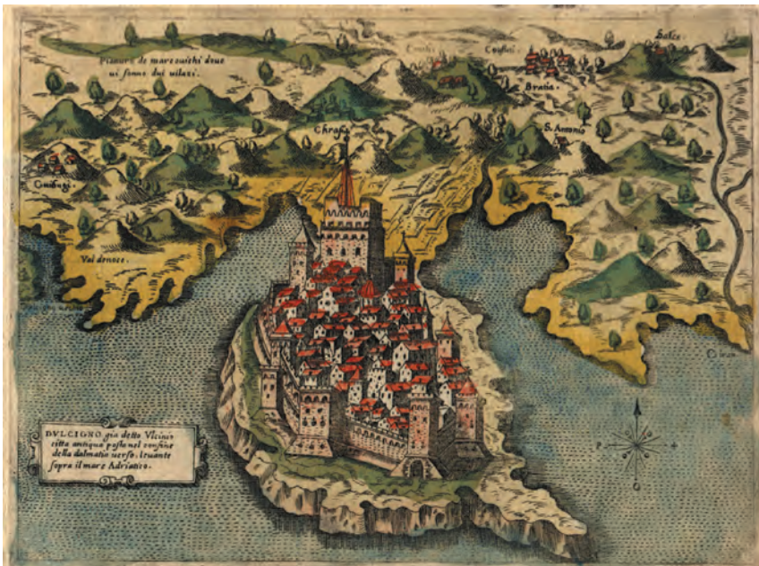
Figure 4: View of Ulcinj published by the Italian Simone Pinargenti.

The territory of Ulcinj, in the centuries preceding the Roman conquest, was inhabited by the Illyrian tribe of Olciniati. Illyrians lived in the region at the time and there are traces