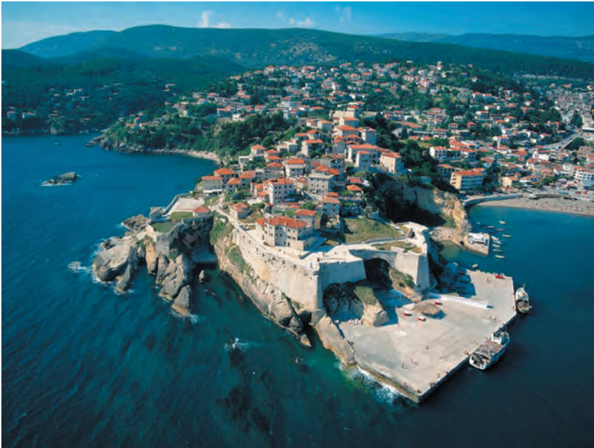
Figure 7: The fortified city of Ulcinj seen from above.

Towards the sea the walls present many buttresses for cannons overlooking the sea and the continuous walkway around the entire defensive perimeter is still visible (Fig. 7). Here, behind the wall, near the second gateway to the city, reachable only after a long flight of stairs, there are archaeological remains of particular interest, in particular a medieval church. It is different from the other one towards the hinterland which has no steps because the goods that were brought from the mainland in the town could be easily transported there.