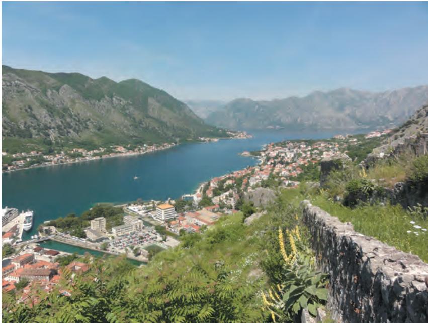
Figure 8: The incredible landscape in which the fortified city is inserted seen from the higher part of the Kotor's walls.

be a negative aspect for the conservation of the cultural heritage. Ulcinj lush vegetation along the walls, the lack of attention to the protection of archaeological sites in the historical centre and the construction of new facilities with inadequate materials and of new architectures divorced with the context are all critical elements.