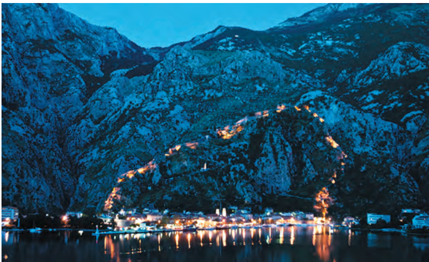
Figure 2: The illuminated walls of Kotor seen from the bay.

Along the wall many bastions and ramparts are present to allow a constant monitoring of the surrounding area. Ramparts and platforms for artillery are connected to each other