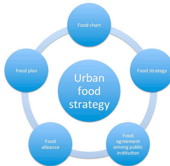
Figure 2: Pisa, Urban food strategy

environment and planning were introduced in the group discussions and ranked according to an open poll. The best ranked strategies and actions were taken into consideration in the “Valdera strategic plan” approved by the Valdera Union.