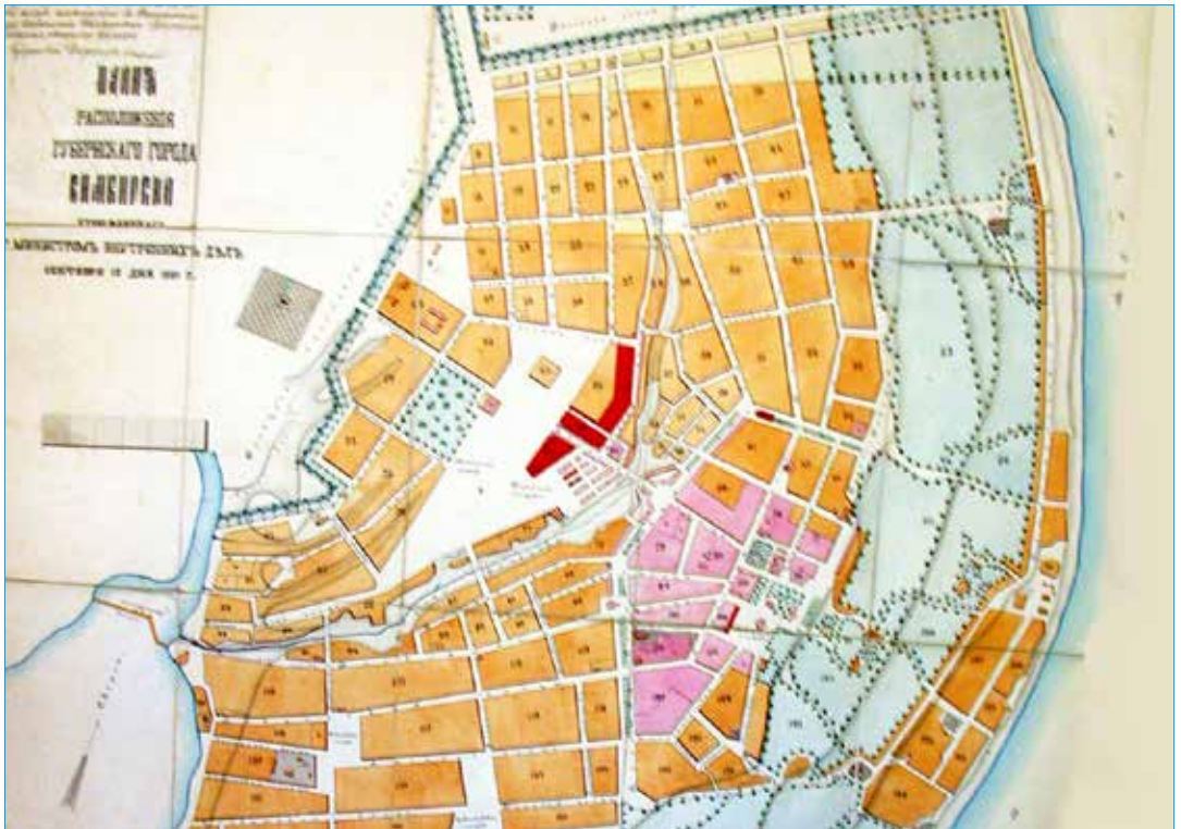
Fig. 1 - Historic map of Simbirsk, 1787