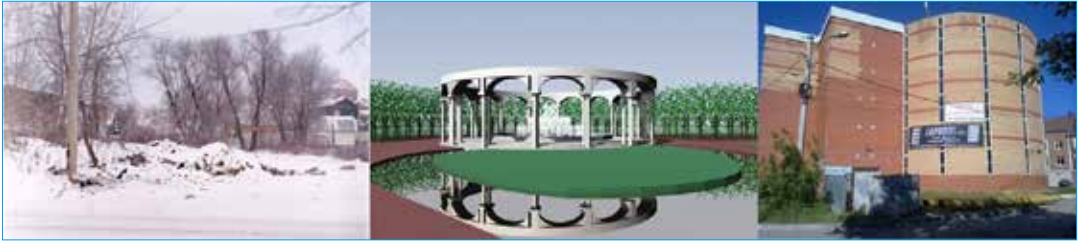
Fig. 3 - The situation of the Simbirka River is at the left, 2002; the graduation project by M. Komarova is at the center, 2003; the parking lot is at the right, 2015

of the river Simbirka from the lake Marishka and downstream. The project has been made; the reconstruction of the river bed with concrete constructions was started. But the works were not completed, and were stopped by unknown reasons. At the same time, the construction of the reinforced concrete parking lot in the buffer zone of cultural heritage continues, causing irreparable damage to the existing and long ago abandoned urban landscape.