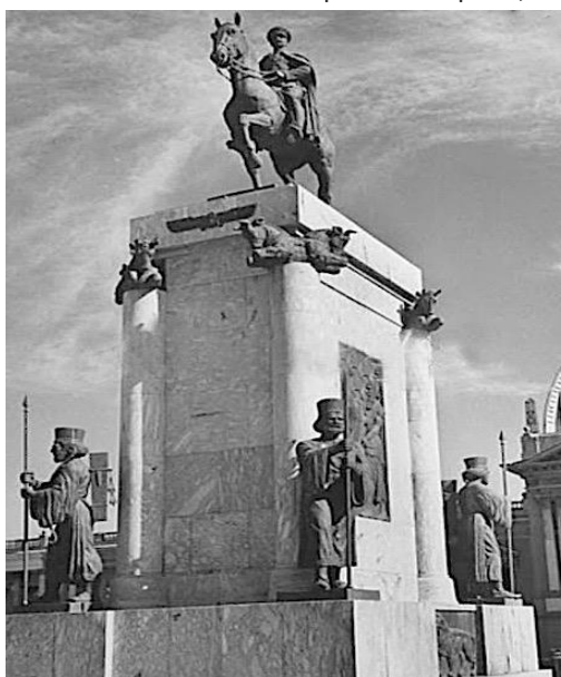
Figure 2 - Reza Shah Statue in Toopkhaneh Square, 1960.

project in Tehran as the result of the global economy, similar to some other cities such as Cairo and Istanbul, was associated with several changes to the socio-spatial structure of the city (MIRGHOLAMI, 2009). New Squares, as the new centers of urban activity, were for the first time filled with figurative sculptures, as an evidence of departure from the past and rupture from the Islam's disapproval of public representation of figures (MAREFAT, 1998). The figures of national heroes or poets, as well as the figures of Reza Shah, replaced the previous pools and gardens of the squares in Tehran, as it can be observed in the images of Toopkhaneh Square (Fig.2). In other words the new squares of the city, were carefully planned open spaces to demonstrate the power of the state and represent its grandeur. Then the squares become the scenes of social demonstrations, political movement and power struggle in the city, as the political demonstrations for nationalizing of oil industry in front of Iranian National Parliament in Baharestan Square (Fig.3) (MEHAN, 2017).