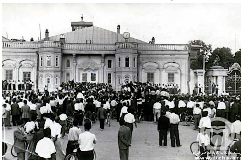
Figure 3 - Demonstration for nationalizing of oil industry in front of Iranian National Parliament in Baharestan Square.