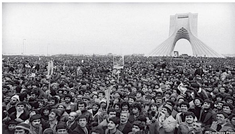
Figure 4 - Azadi Square during the Islamic Revolution of 1978.