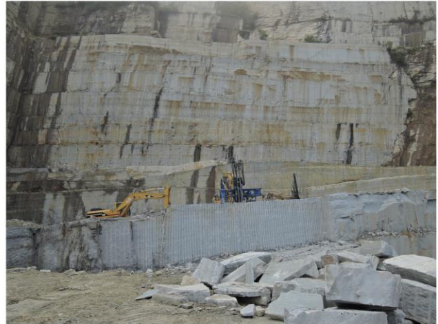
Figure 2. Quarry of Luserna stone in Bagnolo Piemonte (Italy)

consequence, investigations about the most common processes and materials are in progress. In particular, a special focus concerned the calculation of environmental impacts related to the diamond wire, tool often employed during the extraction and cutting phases. The presence of heavy metals in the diamond bead matrix is partly responsible of the contamination of slurry wastes and the composition of the matrix alloy is consequently of relevance for the impact calculation. Through data shared by an Italian firm and data found in scientific papers and patents, the diamond wire was modeled with the possibility of setting specific chemical composition for the matrix alloy.