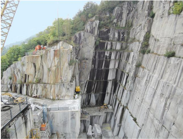
Figure 1. Quarry of beola Formazza in Crevoladossola (VCO Province, Italy).