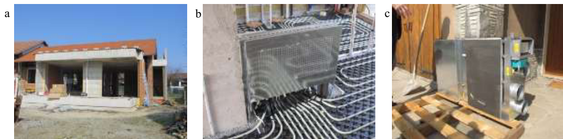
Fig. 1. (a) CorTau House construction site; (b) distribution manifold and radiant floor details; (c) air handling unit

The building spaces are arranged over a single-storey with a net conditioned floor area of 135 m 2 and are designed with particular attention to bioclimatic principles (e.g. orientation of rooms and windows, sun screens). The external vertical envelope, constituted by both structural reinforced concrete bearing-walls and infill masonry walls, offers high thermal inertia. The insulation layer of walls ( U_{\text{wall}} = 0.15 \text{ W/m}^2\text{K} ) and slabs ( U_{\text{floor slab}} = 0.19 \text{ W/m}^2\text{K} , U_{\text{roof}} = 0.15 \text{ W/m}^2\text{K} ) consists of rock-wool panels and the whole envelope is accurately designed in order to minimize the creation of thermal bridges and the air infiltration and to provide barriers to rising damp. Windows are composed by aluminum frame with thermal break with low-e triple-pane glass with argon ( U_{\text{window}} = 0.96 \text{ W/m}^2\text{K} ). The low heating ( Q_{\text{H,nd}} = 17.2 \text{ kWh/m}^2\text{y} ) and cooling needs ( Q_{\text{C,nd}} = 19.7 \text{ kWh/m}^2\text{y} ), due to the insulated and massive envelope, contribute to limit the total building energy demand.