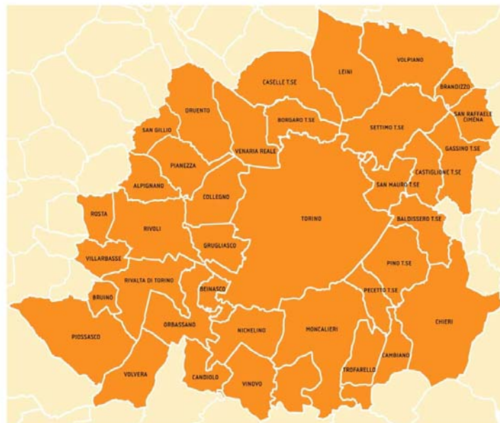
Figure 1. Torino and his metropolitan area .

Nichelino is a 48,000 inhabitants city (2011 census) spread over an area of 20.6 square kilometers south of the Turin metropolitan area.