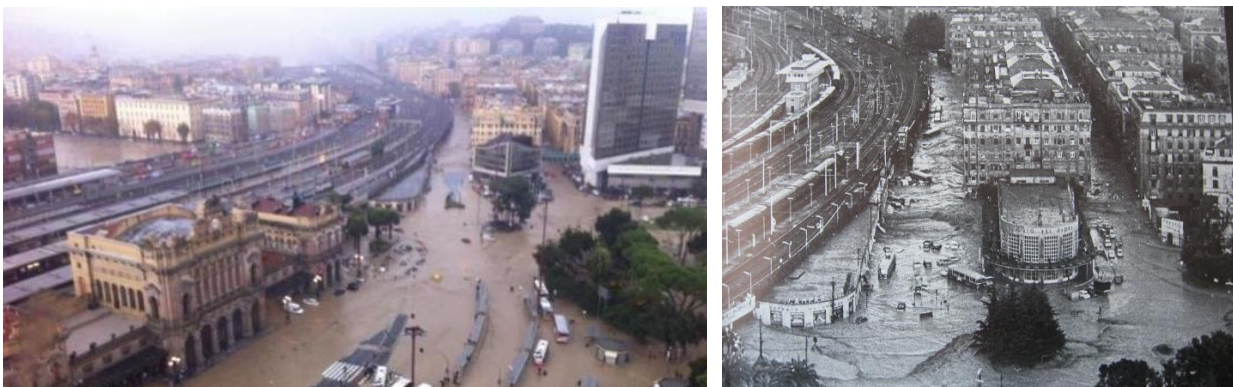
Figure 1. Brignole railway station: flood of 2014 and 1970

After each catastrophe, the Emergency Plan was updated bit by bit with some additional "detailed plans", concerning specific areas or infrastructures, and finally a structural intervention on the creek which caused the flood was programmed.