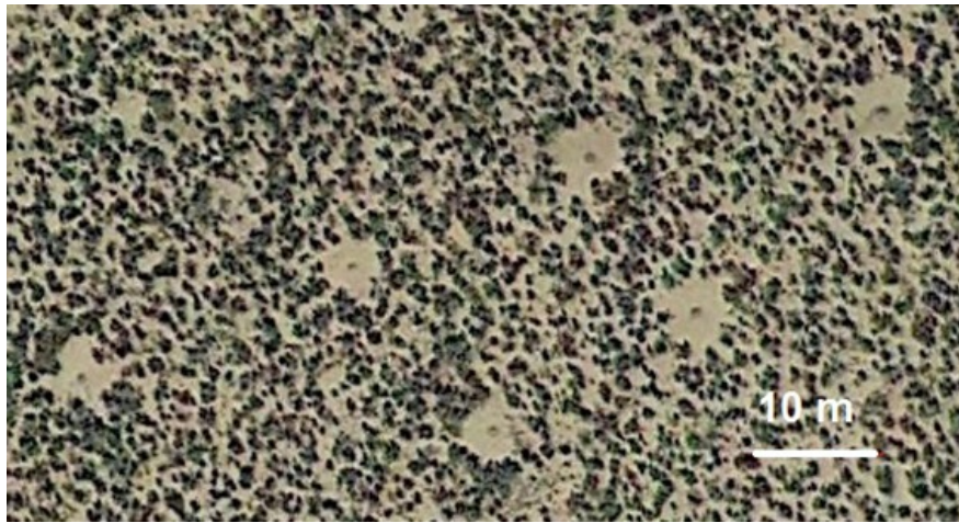
Figure 4: Discs in patterned vegetation (coordinates: 36°14'55.07" N, 113°05'05.22" W).

Of course, question could arise about the cause of such discs. If we compare the discs in the Figure 4, with a red harvester ant nest sketched in Ref.10, it seems that they are in fact the nests of these ants. However, since the dryland ecosystems can exhibit patterns of vegetation created by the competition between individual plants [11], a local investigation is required. However, in any case, due to the irregularity of the polka-dot pattern, I would like to exclude an unnatural origin.