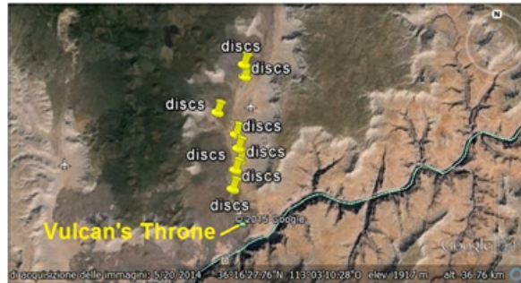
Figure 1: The markers show a large area, 10 km long, near the Grand Canyon, where it is possible to observe a patterned vegetation, like that given in the following Figure 2.

Reference 9 is fundamental to understand the patterned vegetation that we can find in another area of Arizona. It is near the Vulcan's Throne, a cinder cone volcano and a prominent landmark on the North Rim of the Grand Canyon. This area is not reported in [9], probably because in 2008 the satellite images had a low resolution. Today, using Google Earth for the areas marked in the map shown in the Figure 1, we can see a large landscape covered by discs, that look like those shown in Ref.9. For this reason, we are here proposing that these discs are nest discs of ant colonies. The number of these discs, disseminated in a valley 10 km long is impressive.