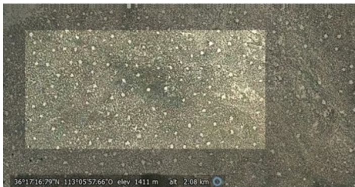
Figure 2: Patterned vegetation having a "polka-dot" arrangement

(coordinates: 36°17'16.79" N, 113° 05' 57.66" W). A part of the image has contrast and brightness enhanced.