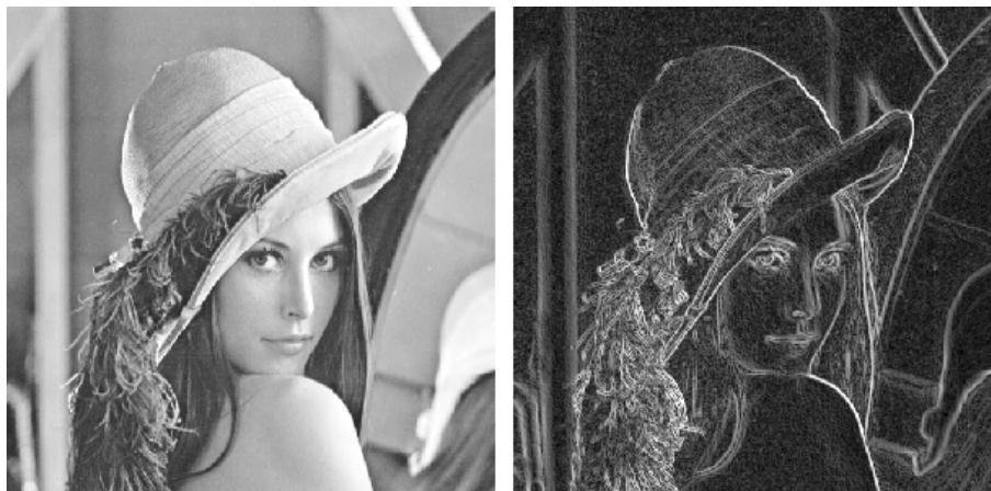
Fig.2 The original image map on the left. On the right, the map obtained evaluating the determinant of local quadrupole moments, according to Eqs.10 and 12. Note that the quadrupole distribution is giving again the edges.

In the case we apply the quadrupole approach, we obtain the map shown in Fig.2. As in the case of the dipole map, the used neighborhood is that with 2 \times 2 pixels. Fig.2 gives the map representing the absolute value of determinant, map which is obtained by means of Eqs.10 and 12. This map again is clearly showing the edges in the image.