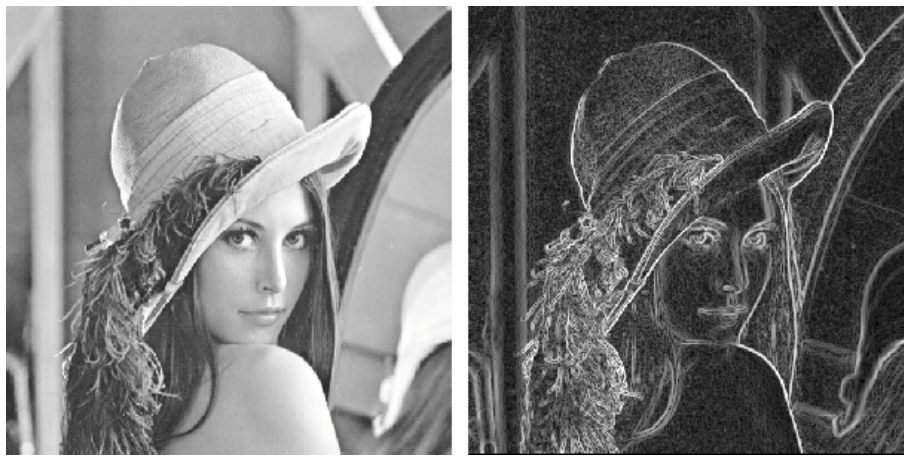
Fig.1 The original image on the left. On the right, the map obtained evaluating the magnitude of local dipole moments, according to Eqs.10 and 11. Note that this map is giving the image edges.

A sharp brightness change corresponds to changes in properties of physical objects. Discontinuities in image brightness are likely to correspond to discontinuities in depth or in surface orientation and changes in material properties. Moreover they can correspond to variations in scene illumination. Applying an edge detector to an image map gives a set of curves describing the boundaries of objects. But these boundaries can be used to represent the real objects. For this reason, the edge detection is very important to reduce the amount of data, while preserving the relevant structural properties of an image.