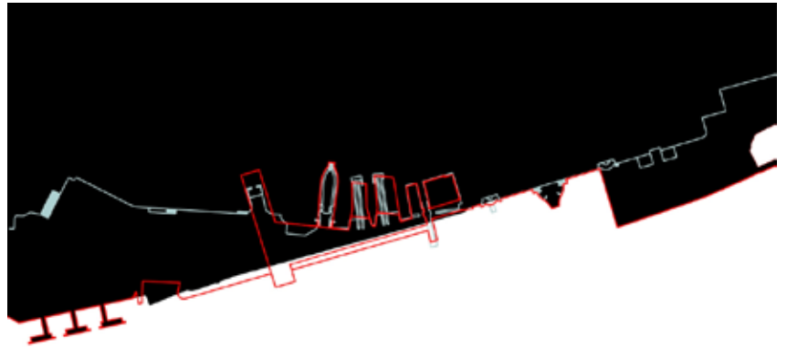
— 古老边界/Antique margin — 实际边界/Actual margin — 设计边界/Proposal margin