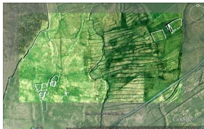
Figure 4: Runrig of Foula, Shetland Islands.