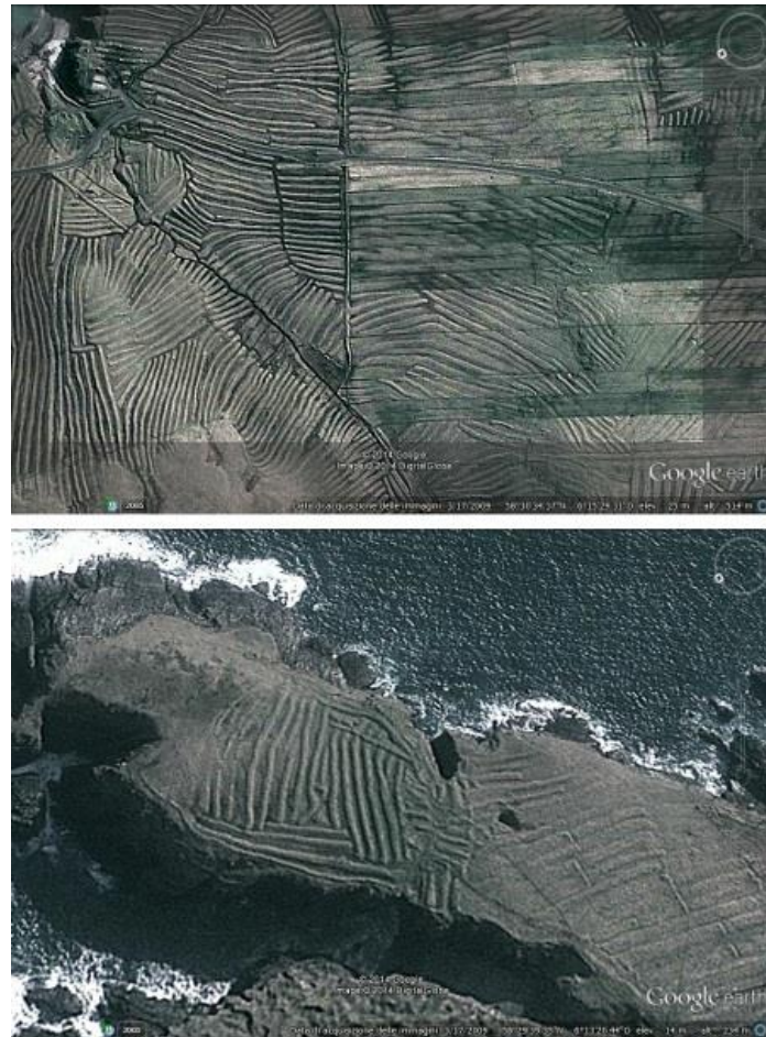
Figure 2: Other examples of runrig. In the upper panel we can see this ancient system visible under the modern agricultural activity. In the lower panel, we have runrig over a promontory near Port of Ness, Isle of Lewis. In this case, it seems that a sort of artistic intent had been added in creating these earthworks.

Today, this Andean agricultural technique is studied and its use suggested because it is a kind of environmentally friendly farming [4]. As previously told, waru-warú cultivation takes place in the soil of raised beds created by the construction of embankments. Within these beds, the new soil has an increased porosity, which allows an enhanced infiltration. The infiltration is 80% to 100% that of the original soil [4]. This agricultural system is recycling nutrients, chemical and biological, necessary for crop production. The raised beds receive their water through diffusion and capillary movements from the surrounding canals [4]. Therefore, the soil is kept at an adequate moisture level to facilitate the cultivation of plants such as potatoes and quinoa [4]. Because of the enhanced moisture level, thermal energy is captured and retained by the raised beds and the plants are protected from the effects of frost. As remarked in [4], the waru-warú system acts as a thermal regulation of the microclimate of these fields.