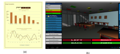
Fig. 2. Developed (a) web portal and (b) smartphone application

In addition the smartphone application shows this information exploiting both Virtual and Augmented Reality.