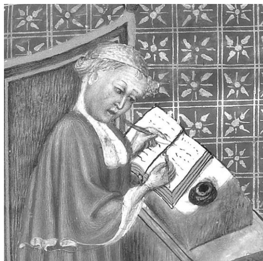
Figure 2 – Nicole Oresme, portrayed in his manuscript Traité de la sphère , dated 1400-1420, at the Bibliothèque Nationale de France, available at gallica.bnf.fr