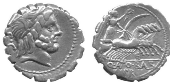
Figure 1 - Denarius serratus of Quintus Antonius Balbus (c. 82-83 BC).

When debasement is made by individuals, usually by clipping or scraping off small amounts of the precious metal, this is for the personal profit. The clipping consists in shaving metal from the coin's circumference. This explains the fact that many coins have their rim marked with stripes, text or some pattern that would be destroyed if the coin were clipped. Although the metals in current coins are not intrinsically valuable, milling is used as a deterrent to counterfeiting or simply for decoration. Probably the first examples of coins with marks on the rim to avoid clipping are the Denarii Serrati of the Roman Republic (Figure 1). Other examples of bad money include counterfeit coins. In the case of clipped, scraped, or counterfeit coins, the commodity value was reduced by fraud.