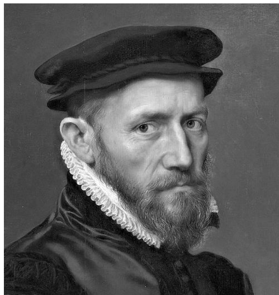
Figure 4 - Portrait of Sir Thomas Gresham by Anthonis Mor.