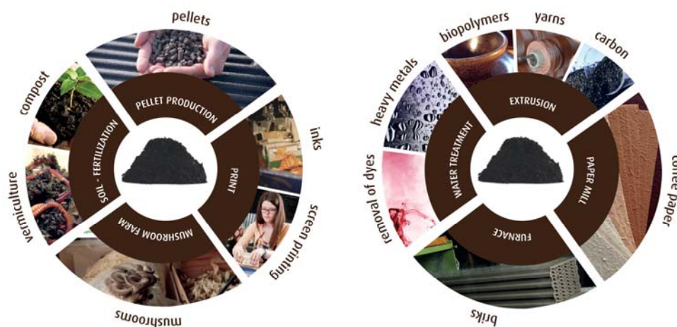
Figure 3 – Application fields of exhausted SCG

Some universities chemically analysed SCG, pointing out a high presence in them of phenolic compounds with significant antioxidant activity [11; 12; 13; 14], suggesting the possibility of using the waste as a resource of natural antioxidants or as a source of polysaccharides with an immunostimulant activity [15]. By extracting the lipids with supercritical fluid extraction (250 bar at 50°C) they were able to develop new cosmetic formulas [16].