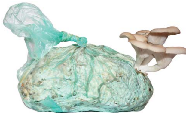
Figure 5 –Experimentation with mushrooms

After the process of oil extraction, 665 kg of exhausted SCG are obtained, that are mixed with 190 kg of bagasse, and they are used as substratum for growing the mushrooms. Even in the cultivation of the Pleurotus Ostreatus mushrooms, outputs of two processes are used to generate a product that has a market value. The substrate is inoculated with 25 kg of mycelium and it is stored in the dark for several days, at the end of which it takes place the fruiting of mushrooms (Figure 5).