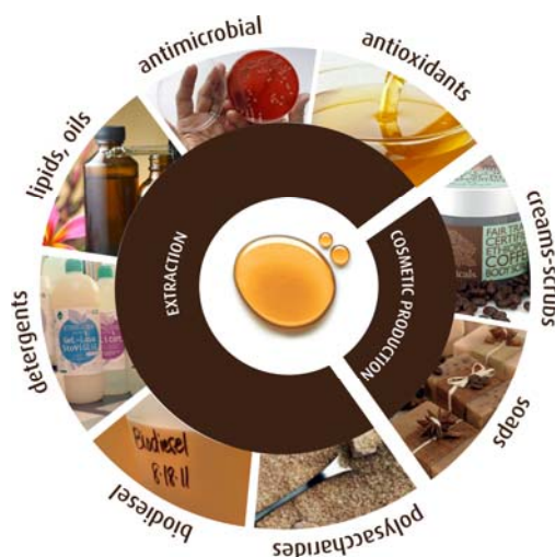
Figure 2 – Application fields of oils

SCG should be split into their two constituent elements (secondary raw materials): the oils and the exhausted coffee grounds, each of which finds different application sectors.