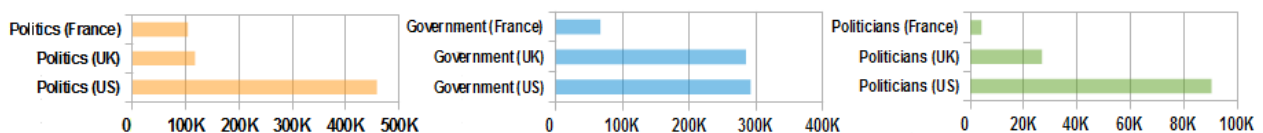
Figure 1: Comparison between the coverage of US politics and the coverage of politics of other countries

In order to compare the coverage of US politics with the coverage of politics of other countries, we identified three main areas of political domain, selecting in each area three Wikipedia categories for the countries of interest (i.e, United States, United Kingdom, and France). These main areas, which correspond to the graphs below, are: (i) conduct, practice, and doctrine of politics of a country (see Figure 1, in orange); (ii) official government institutions and offices of a country (see Figure 1, in blue); (iii) politicians involved in the politics of a country (see Figure 1, in green) 5 .