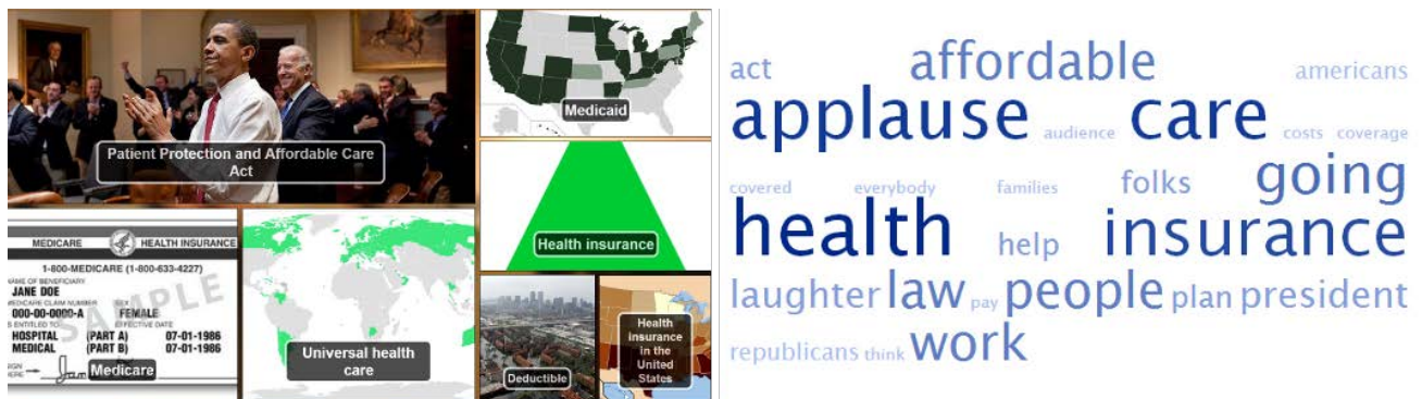
Figure 2: Results obtained with TMF (on the left) and with TagCrowd (on the right)

Furthermore, the results obtained classifying White House speech transcripts demonstrate that TMF is far more suitable to make clear the subject of a political speech compared with a simpler bag-of-words based text analysis tool. The example 16 in Figure 2 shows how TMF identifies as the main topic the unambiguous concept "Patient Protection and Affordable Care Act" 17 while a popular tag cloud tool 18 gives as result a set of often redundant or inconsistent strings.