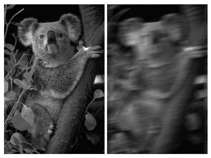
(a) Original image